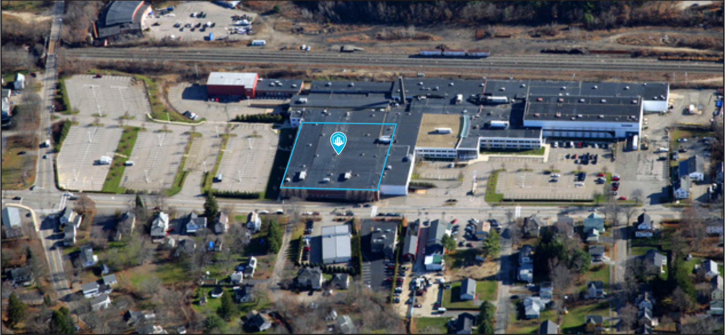
Aerial by LesVants.com