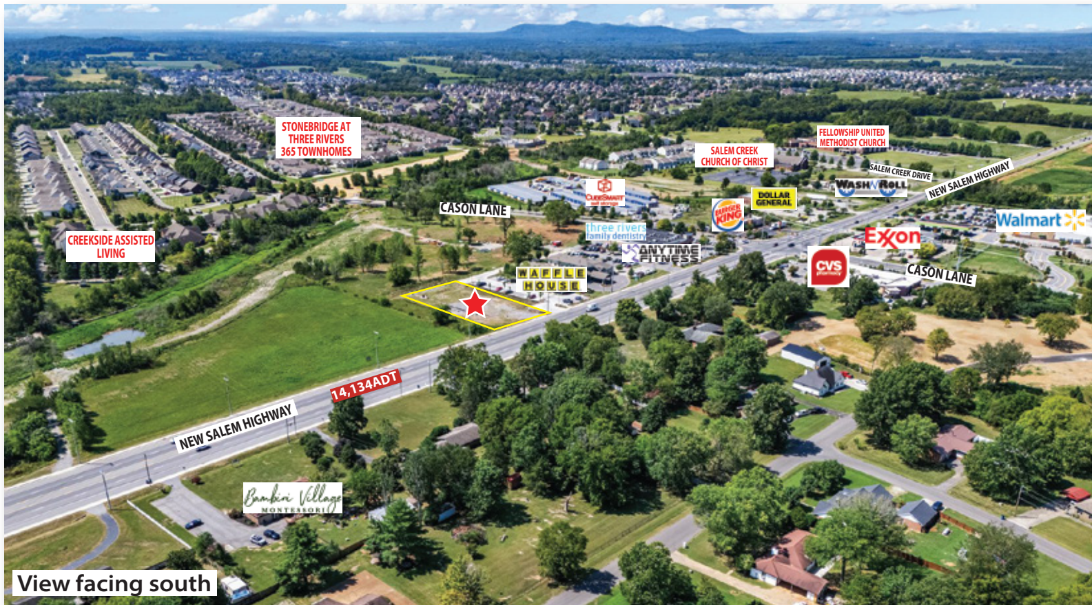
View facing south