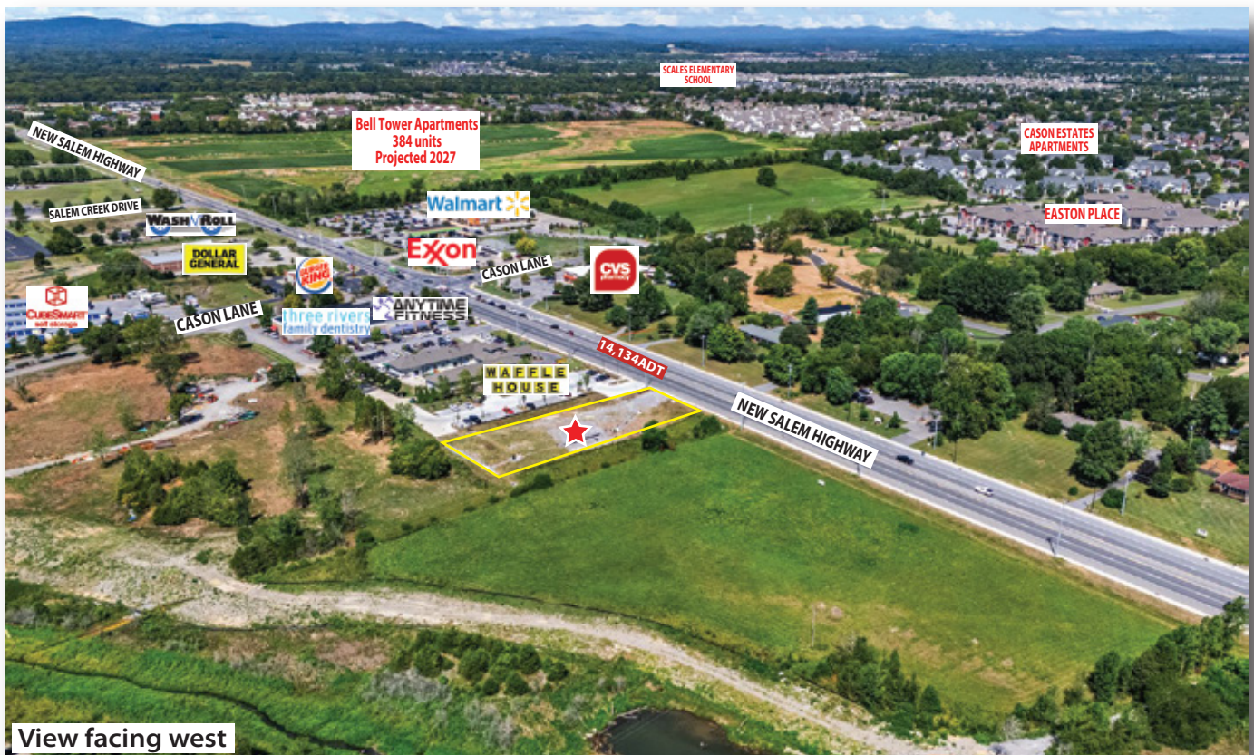
View facing west