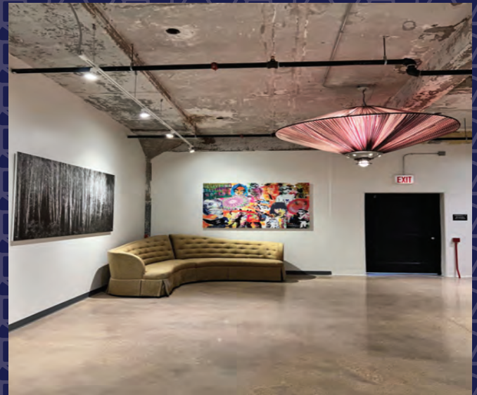
6th Floor Corridor