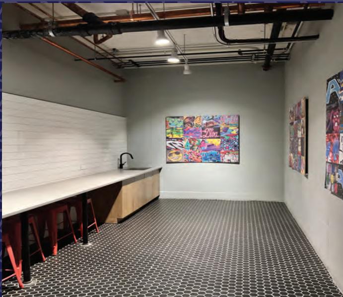
Common Area Kitchenette