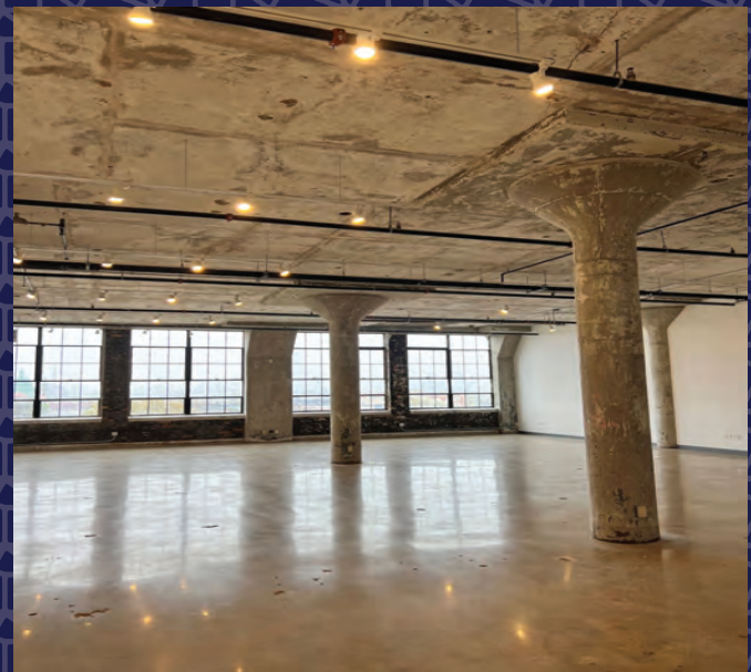
Building Standard Finishes