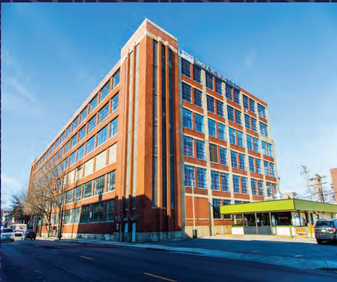
Building shot from 35th