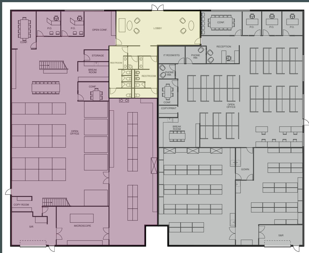
Suite A - Leased