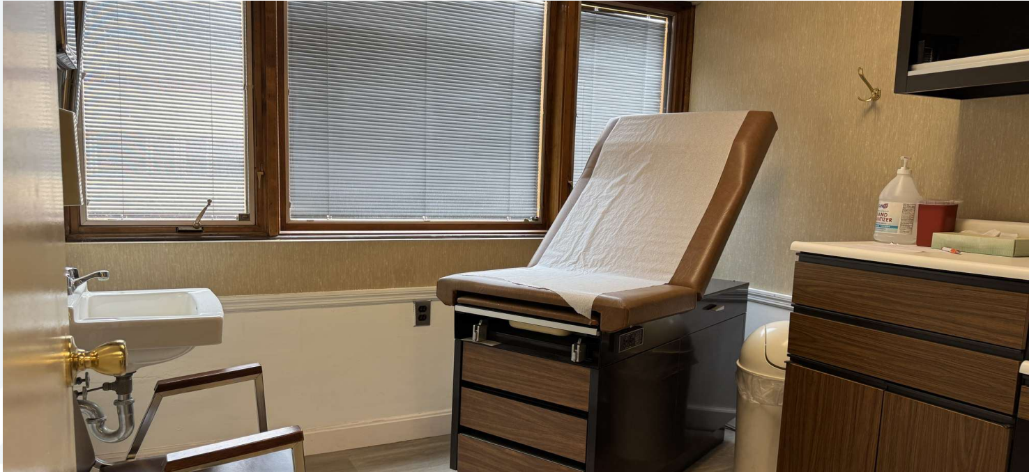
Exam Room 1