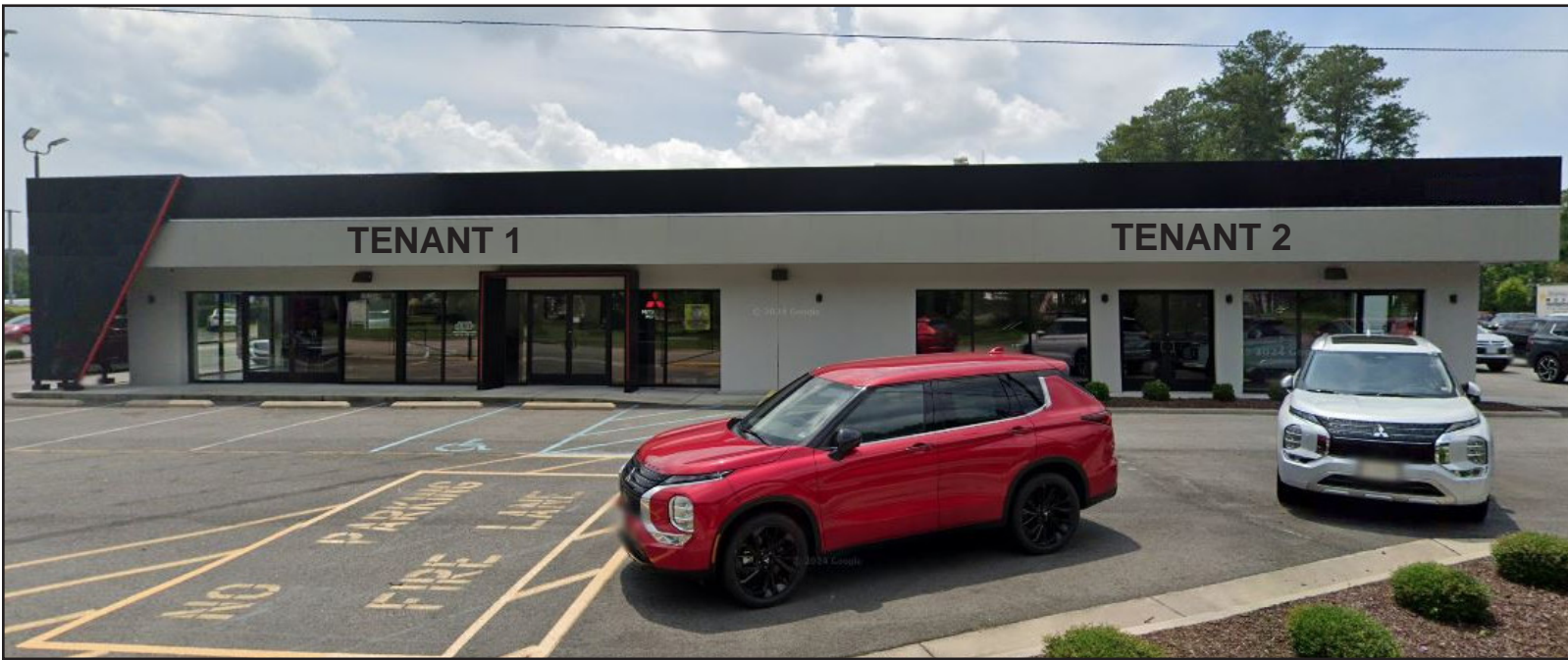
Fairway Mitsubishi Motors | 3825 Bonney Road, Virginia Beach, Virginia