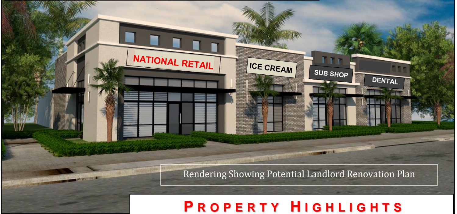
Rendering Showing Potential Landlord Renovation Plan

1517 S RIDGEWOOD AVE, EDGEWATER, FL, 32132