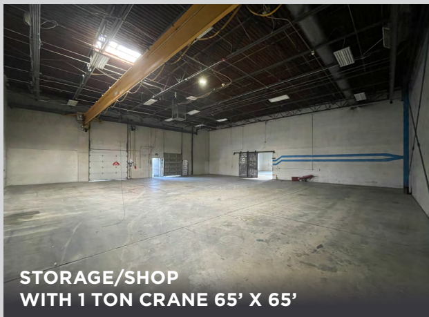
STORAGE/SHOP WITH 1 TON CRANE 65' X 65'