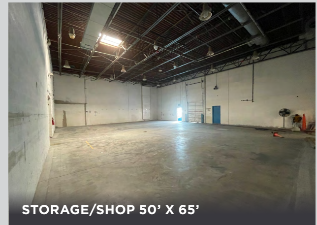
STORAGE/SHOP 50' X 65'