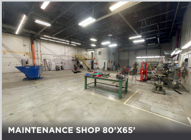
MAINTENANCE SHOP 80'X65'