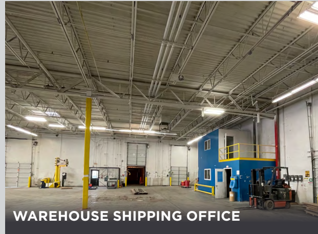
WAREHOUSE SHIPPING OFFICE

UP TO 5.5 ACRES OF OUTDOOR STORAGE ALSO AVAILABLE. FENCED, ROADBASED, PRIVATE ROAD.