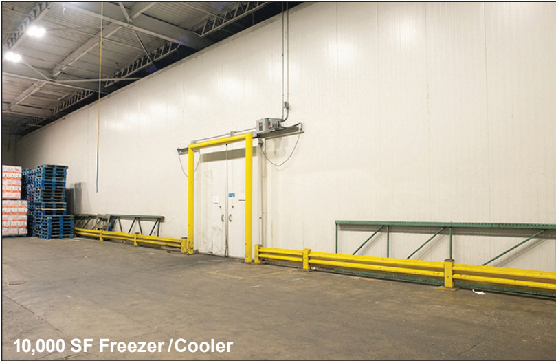
10,000 SF Freezer /Cooler

Ideal for Distribution, Manufacturing, Logistics