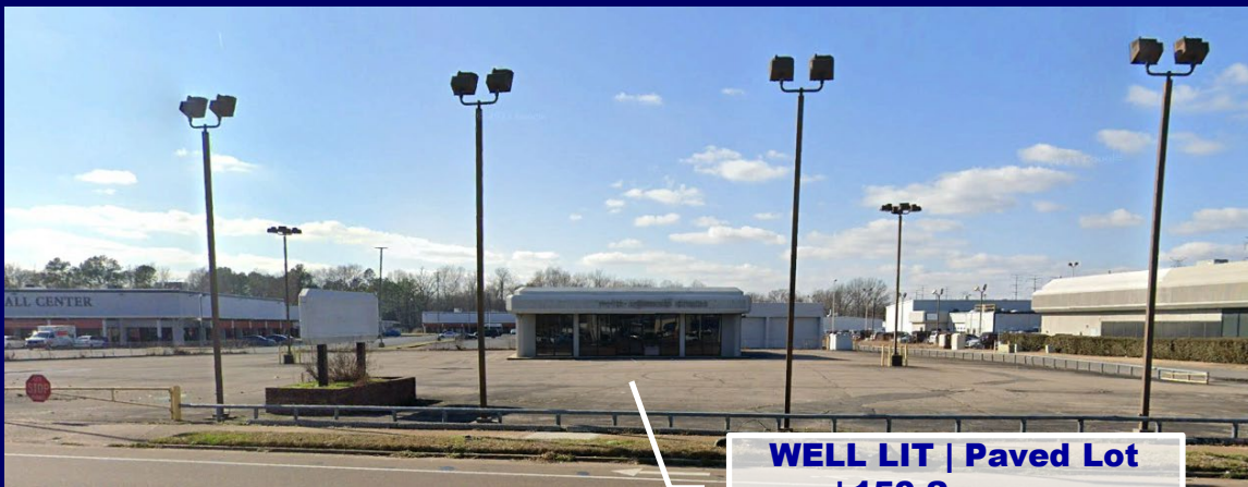
WELL LIT | Paved Lot | 150 Spaces

Zoning makes this an ideal site for QSR, Auto Detail Shop, Car Rental, and so much more.