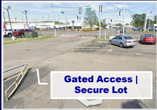
Gated Access | Secure Lot