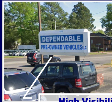
High Visibility | Signage