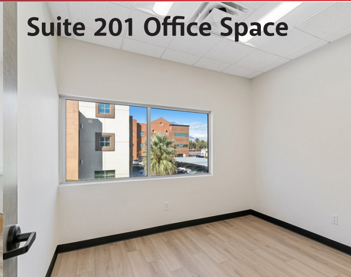
Suite 201 Office Space