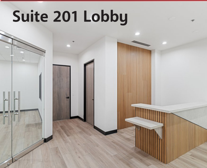
Suite 201 Lobby