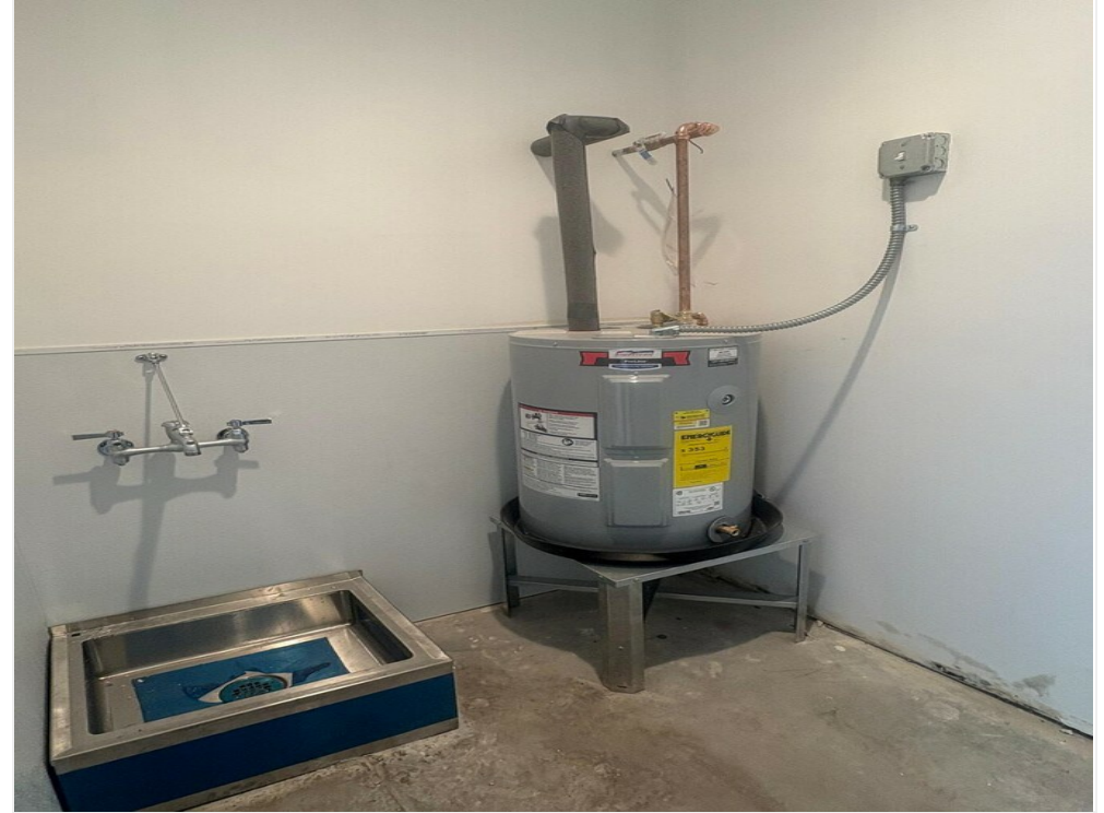
WhatsApp Image 2024-12-10 at 12.23.53 (1)