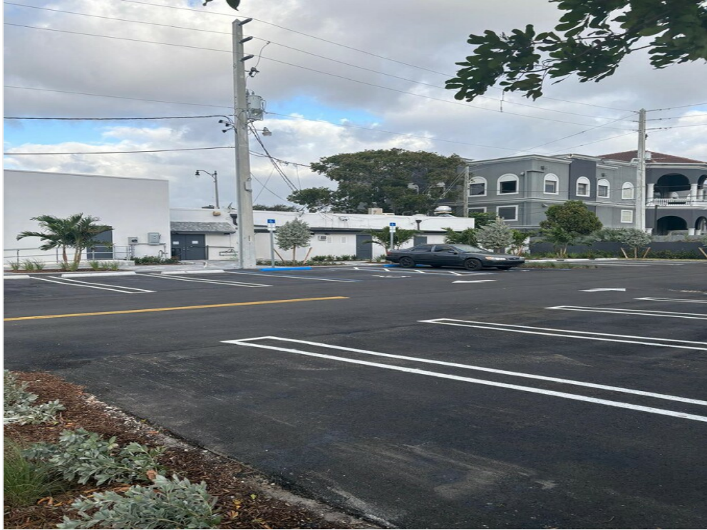
WhatsApp Image 2024-12-13 at 11.48.34 (5)