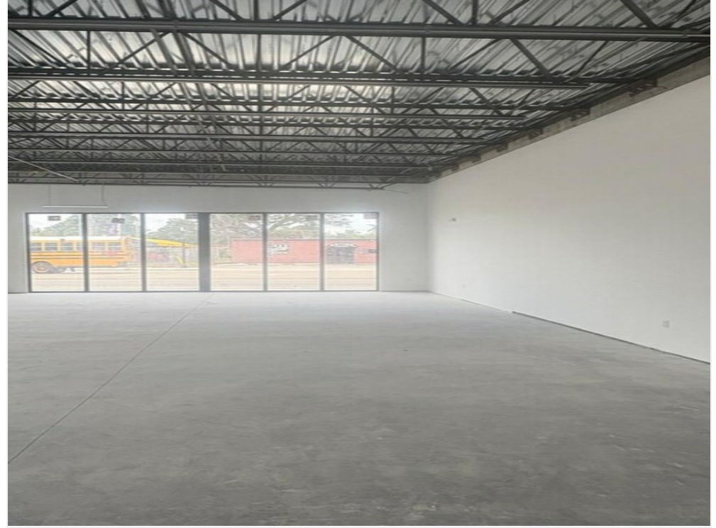
WhatsApp Image 2024-12-10 at 12.23.50