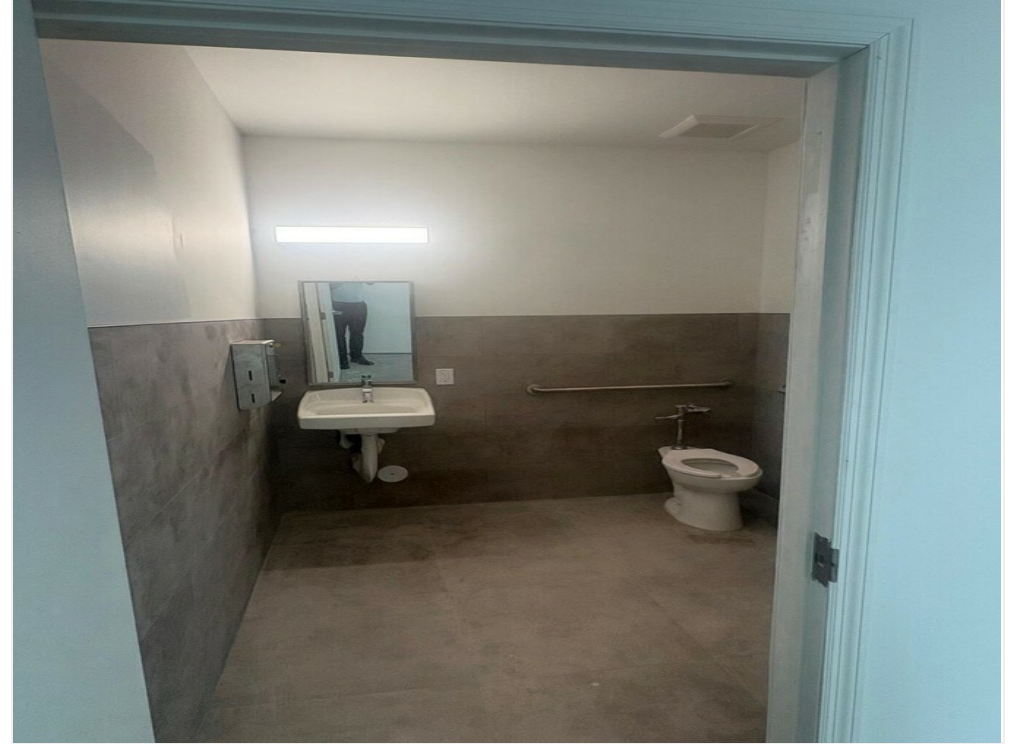
WhatsApp Image 2024-12-10 at 12.23.52 (1)