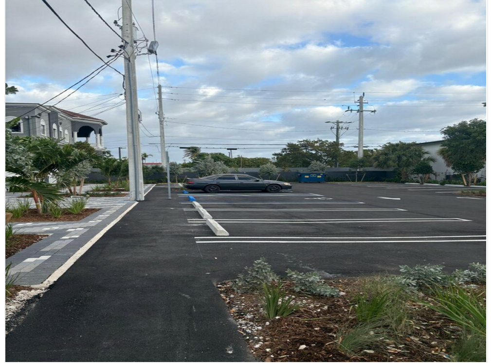
WhatsApp Image 2024-12-13 at 11.48.34