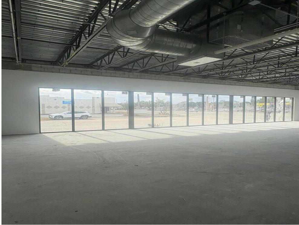
WhatsApp Image 2024-12-10 at 12.23.49 (1)