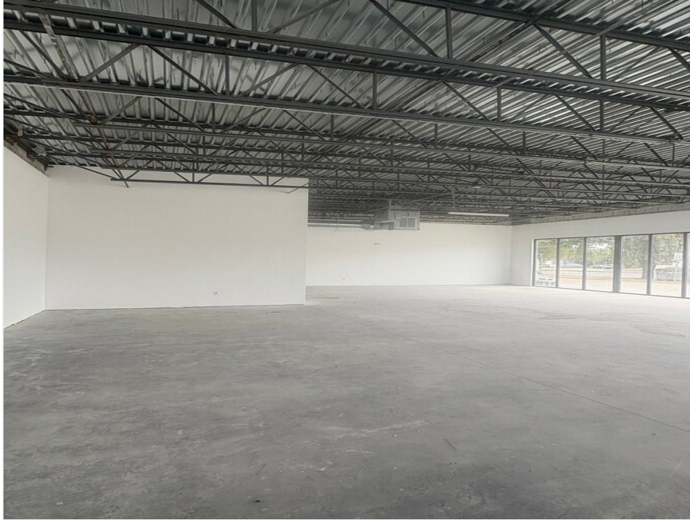
WhatsApp Image 2024-12-10 at 12.23.51