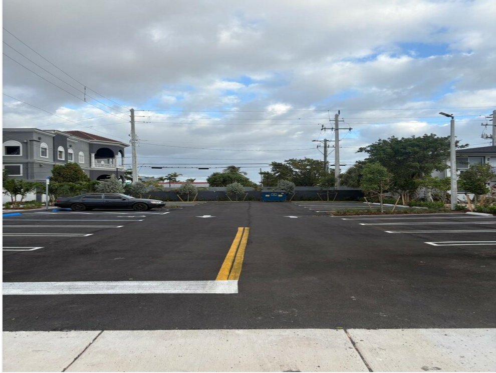
WhatsApp Image 2024-12-13 at 11.48.34 (1)