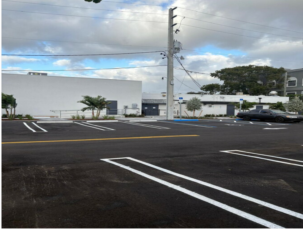
WhatsApp Image 2024-12-13 at 11.48.34 (7)