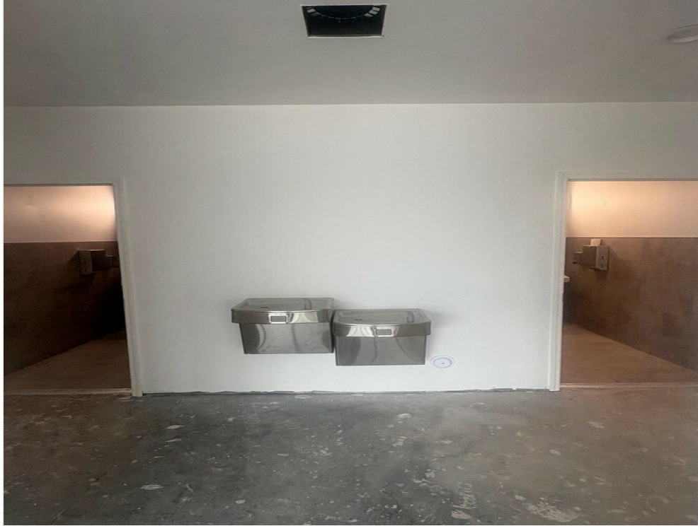
WhatsApp Image 2024-12-10 at 12.23.53