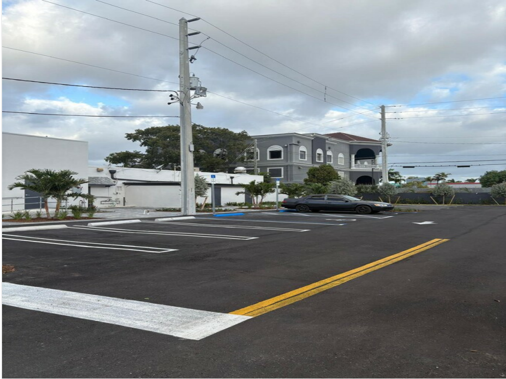
WhatsApp Image 2024-12-13 at 11.48.34 (4)