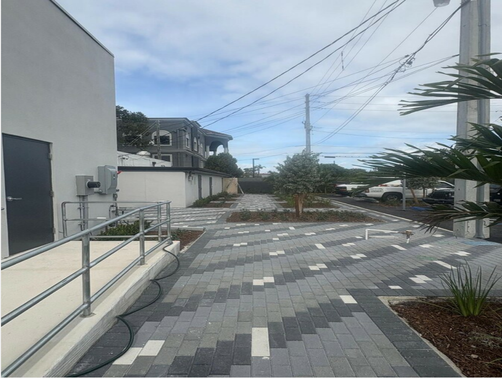
WhatsApp Image 2024-12-10 at 12.23.34