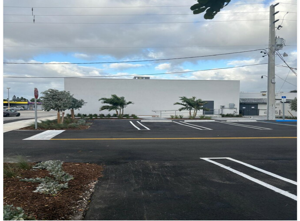
WhatsApp Image 2024-12-13 at 11.48.34 (6)