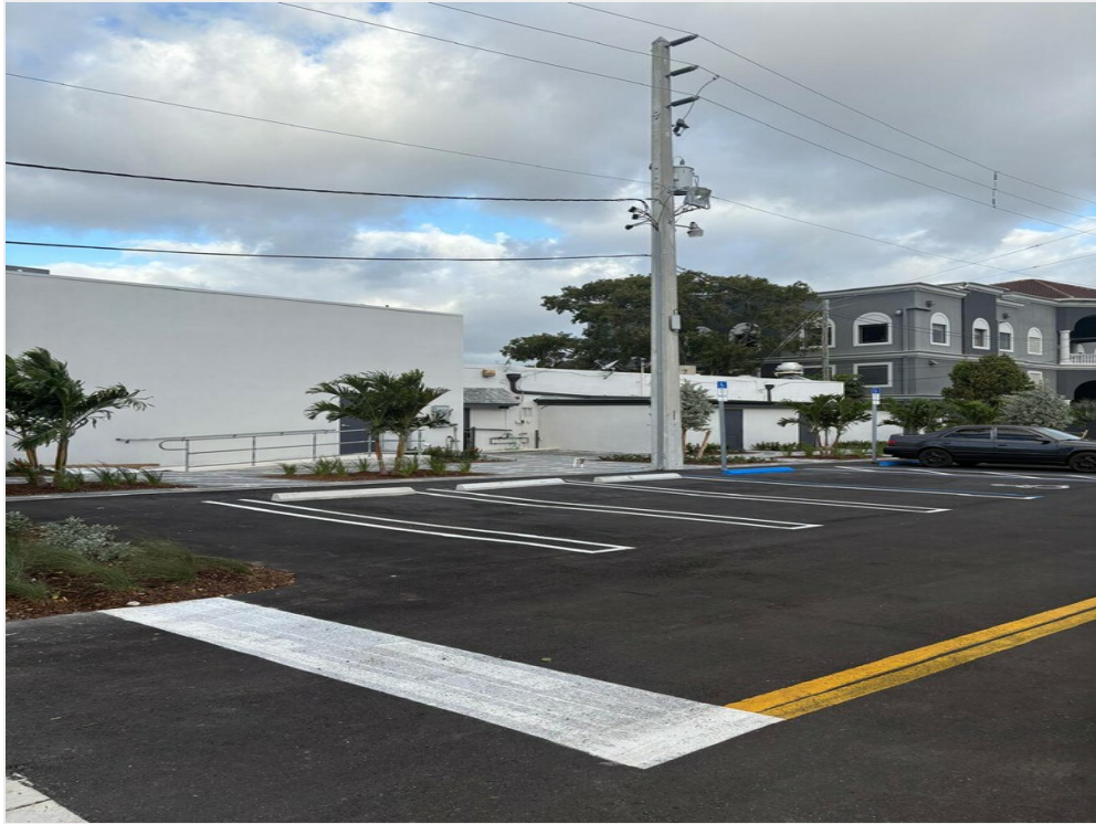
WhatsApp Image 2024-12-13 at 11.48.34 (3)