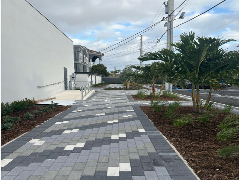
WhatsApp Image 2024-12-13 at 11.48.32