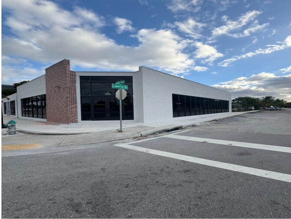
WhatsApp Image 2024-12-13 at 11.48.34 (14)