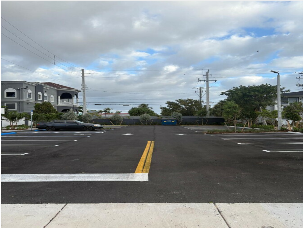
WhatsApp Image 2024-12-13 at 11.48.34 (2)