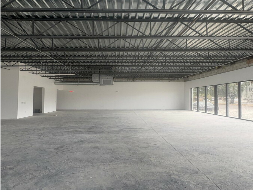
WhatsApp Image 2024-12-10 at 12.23.52 (3)