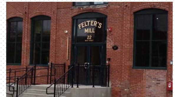
Felter's Mill—mixed commercial development

Blackstone River Valley National Heritage Corridor