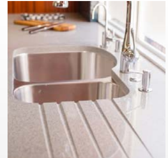
Discover Marble and Granite in the Latti Farm Industrial park