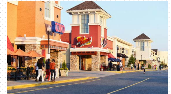
The Shoppes at Blackstone

Driving Distance: to Downtown Worcester— 5 miles to Providence—30 miles to Boston—45 miles