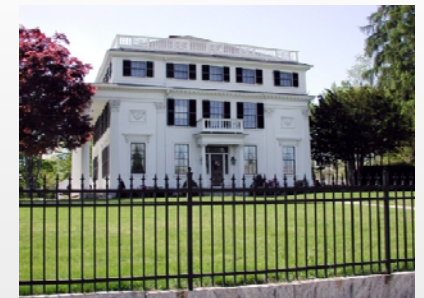
Asa Waters Mansion

Please contact Laurie Connors, Town Planner: lconnors@townofmillbury.net or 508.865.4754