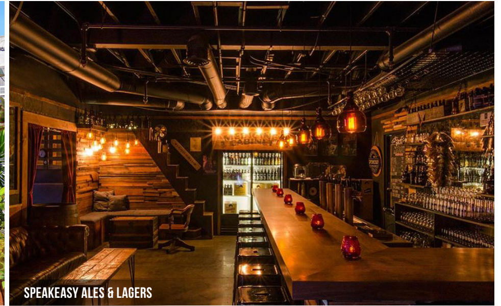
SPEAKEASY ALES & LAGERS