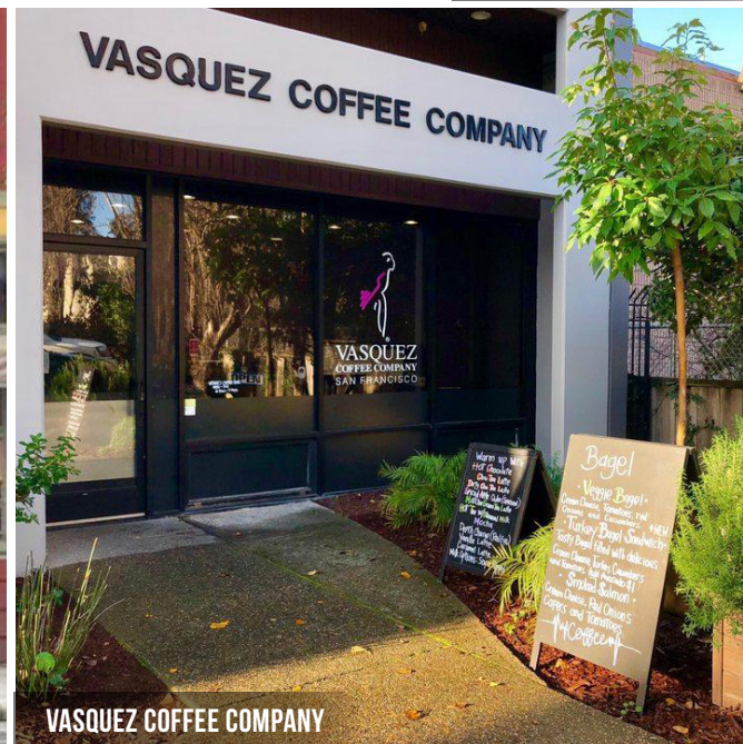
VASQUEZ COFFEE COMPANY