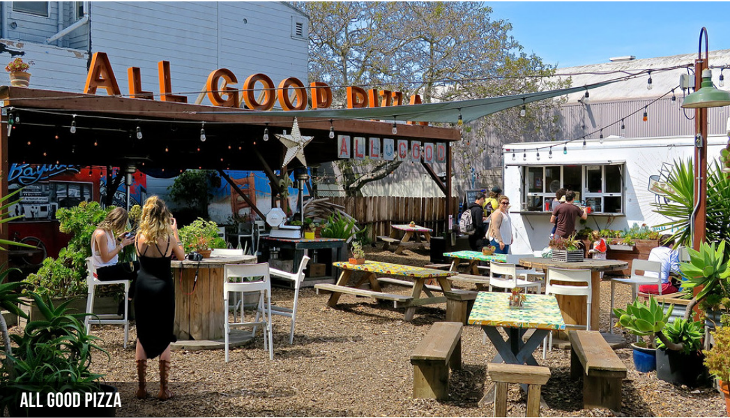
ALL GOOD PIZZA