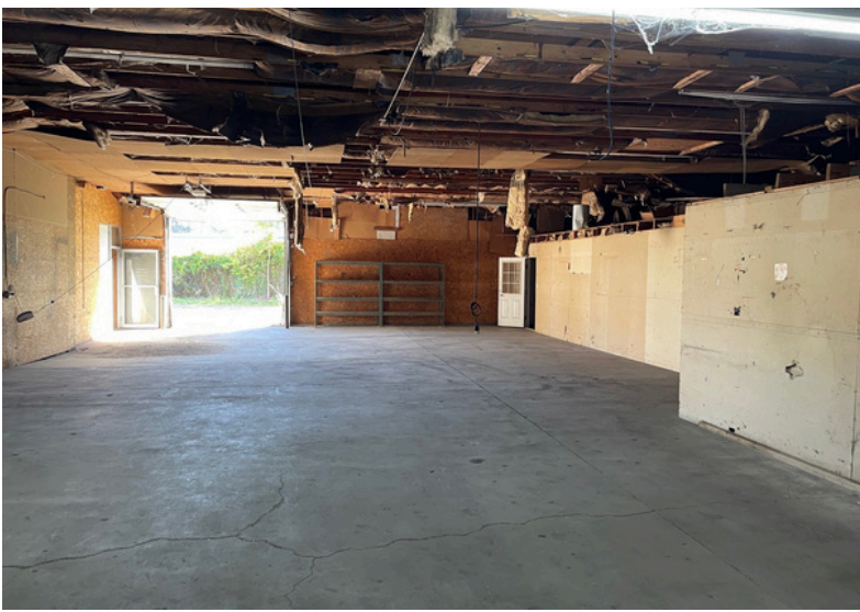
BACK WAREHOUSE AREA

SEPARATE OFFICE AREA WITH PLUMBING FOR BATHROOM