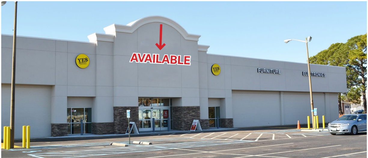
PHOTO GALLERY - 2550-2562 Airline Boulevard, Portsmouth, VA