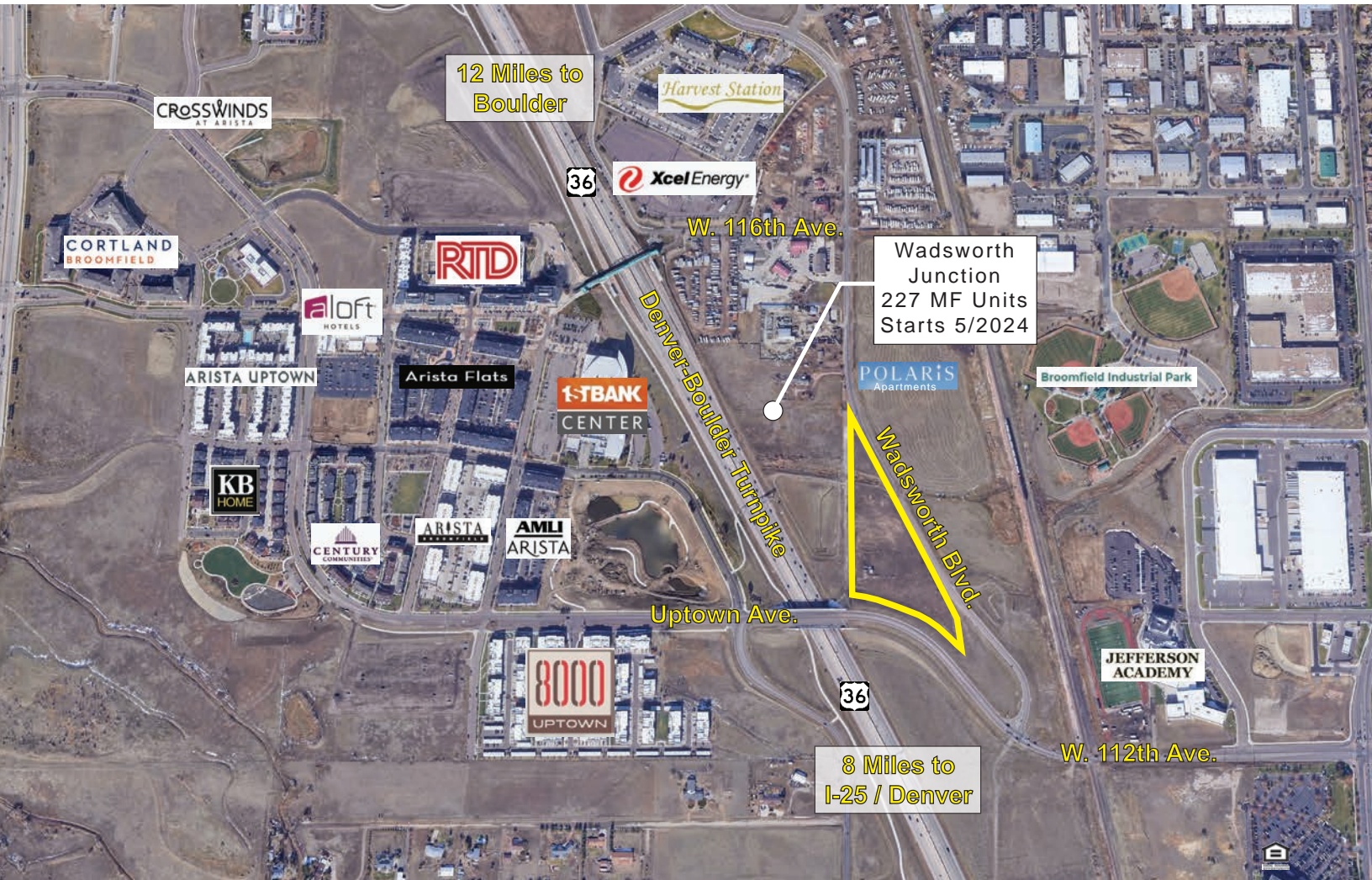
Boundaries presented as a visual reference only. Consult broker for complete legal description. Aerial photographs not available due to proximity to nearby airport.