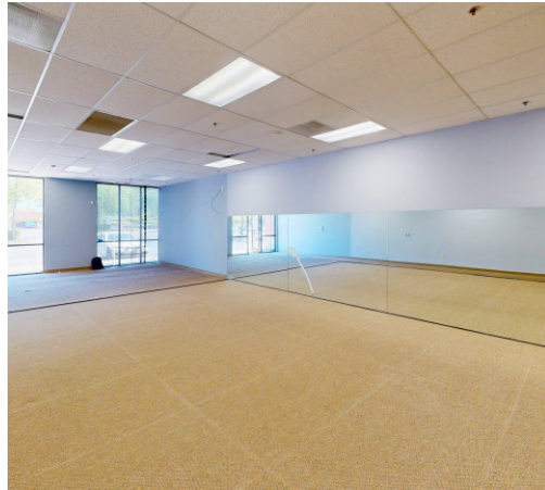
ROOM 23'3" x 79'5"