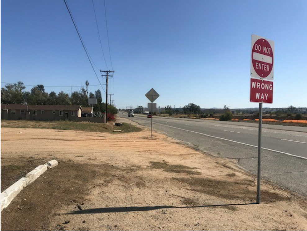
Photo - 13260 215 Frontage Rd frontage