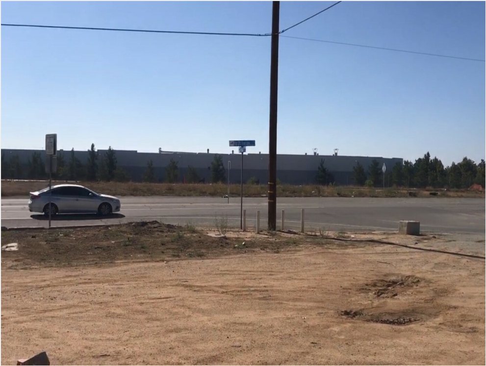
photo - 13260 215 Frotnage Rd corner