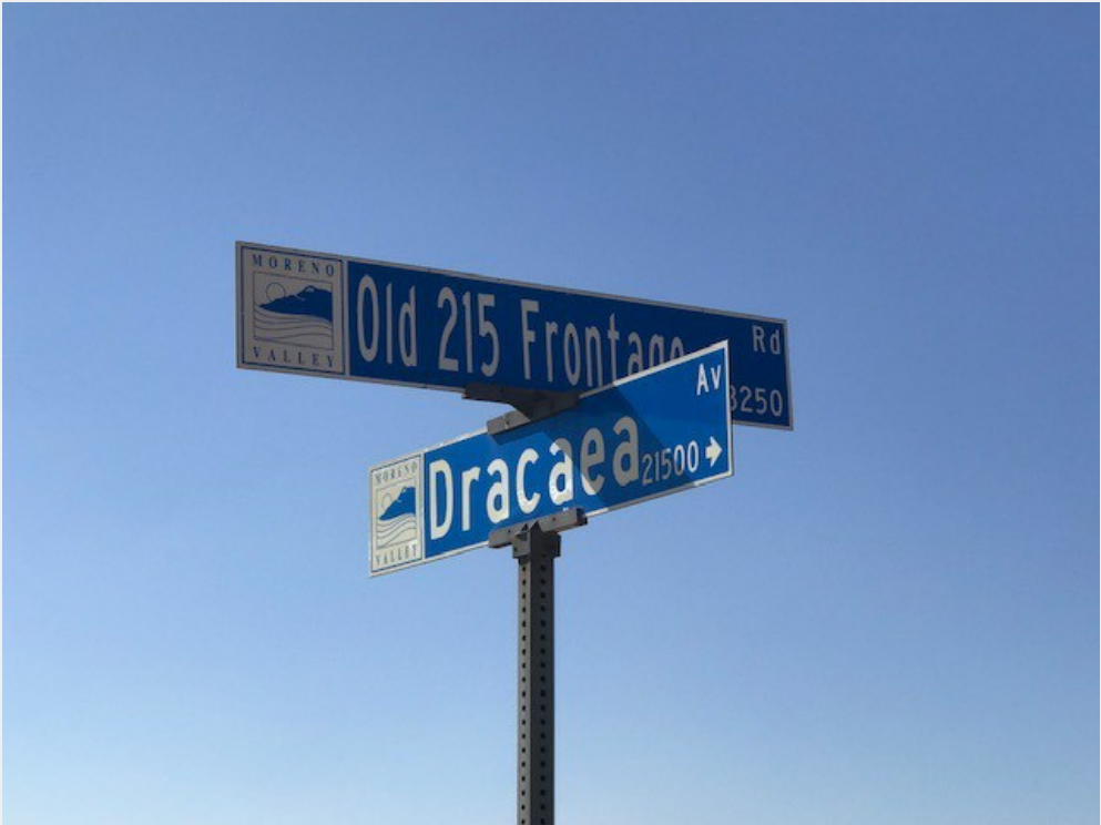
photo - 13260 215 Frontage Rd street signes