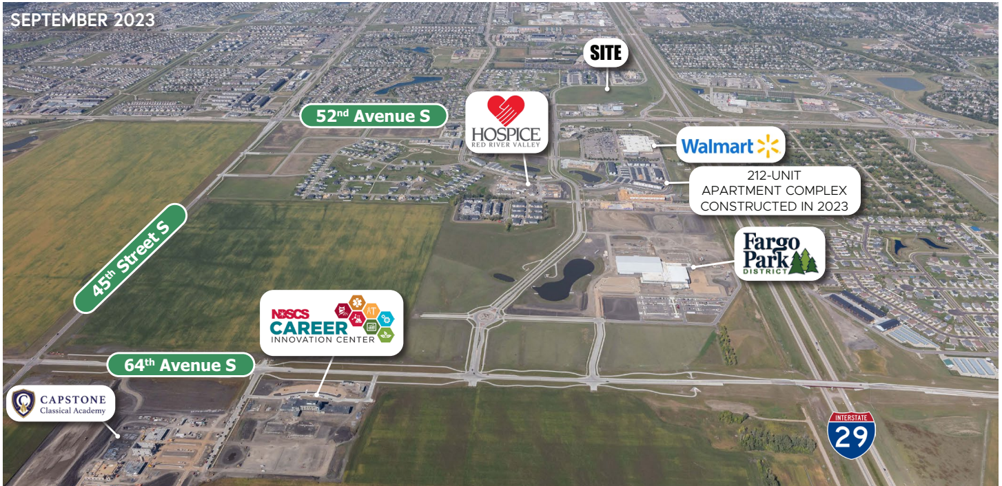
INFORMATION GATHERED FROM FARGOPARKS.COM/FOUNDATION/FARGO-SPORTS-COMPLEX, CAPSTONECLASSICAL.COM, AND NDSCSALUMNI.COM/HOMEPAGE/CONNECT-ENGAGE/CAREER-INNOVATION-CENTER-CIC

the Capstone Classical Academy campus, which is estimated to open in time for the 2024-2025 school year. The North Dakota State College of Science Alumni/Foundation, in partnership with the Cass County Career and Technical Education Center is building a Career Innovation Center. The 87,000 SF project broke ground in July 2021. It is scheduled to open in 2025.