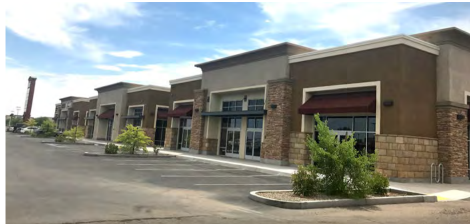
2060 N. Imperial Ave 2,276 SF Available