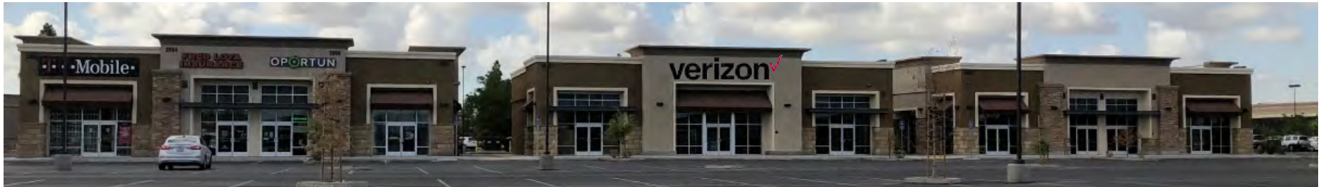
2050, 2060, 2070 N. Imperial Ave. Pad Buildings