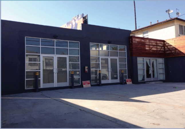
2020 Robertson Blvd. Parking