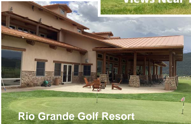
Rio Grande Golf Resort