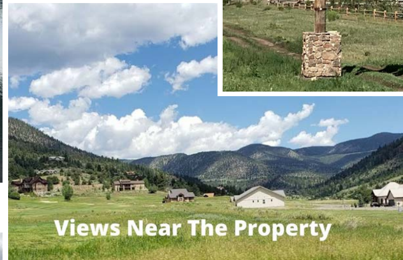
Views Near The Property