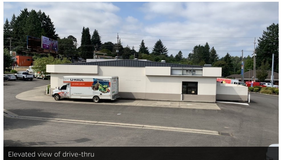
Elevated view of drive-thru