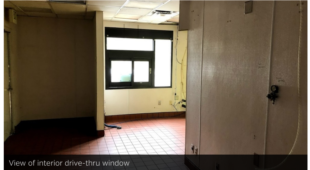
View of interior drive-thru window