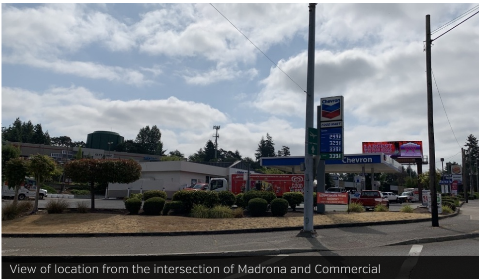
View of location from the intersection of Madrona and Commercial