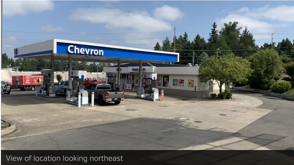
View of location looking northeast