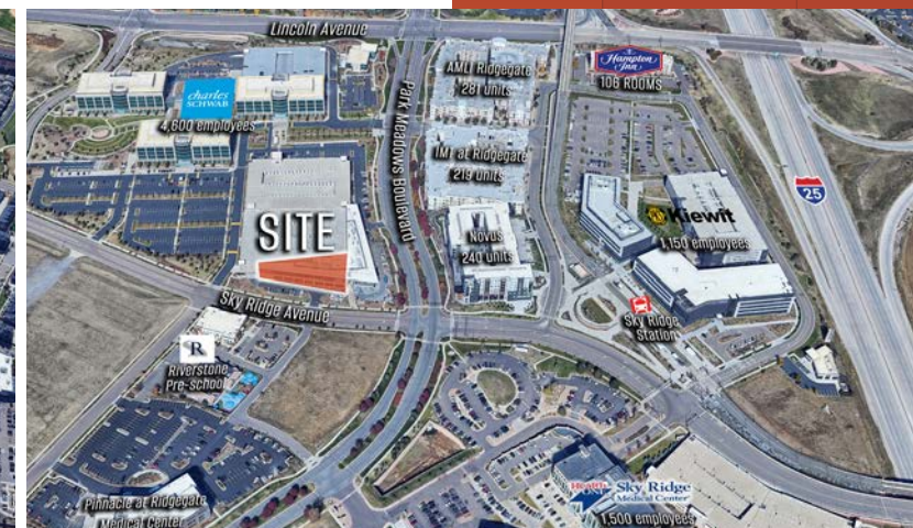
Birds Eye View Looking North