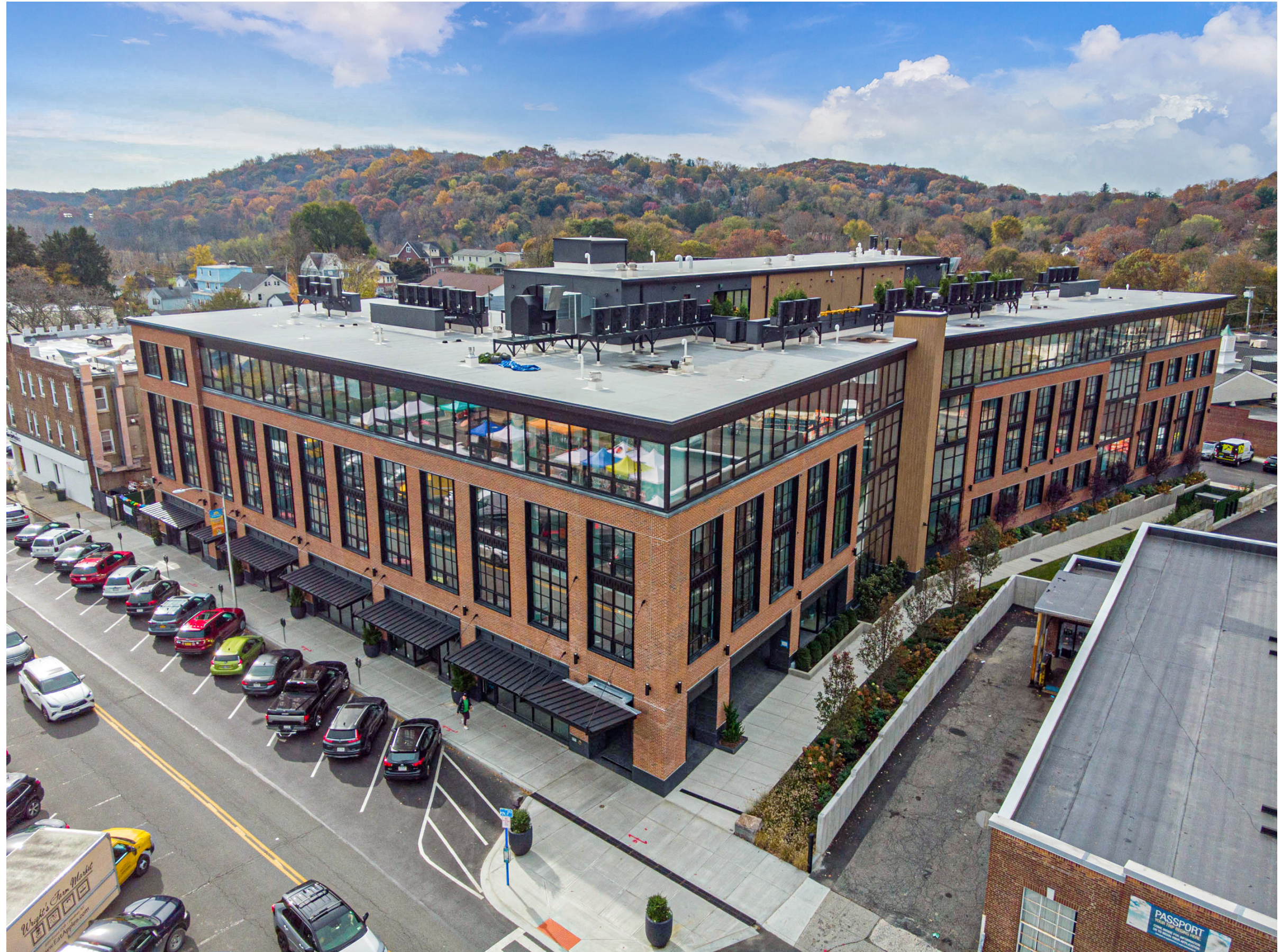
PLEASANTVILLE LOFTS 70 MEMORIAL PLAZA PLEASANTVILLE, NEW YORK