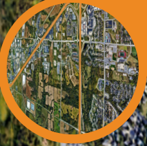
PARK HILL HIGH SCHOOL