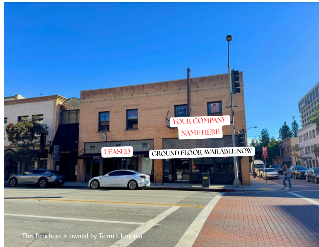
This Brochure is owned by Team Ukropina