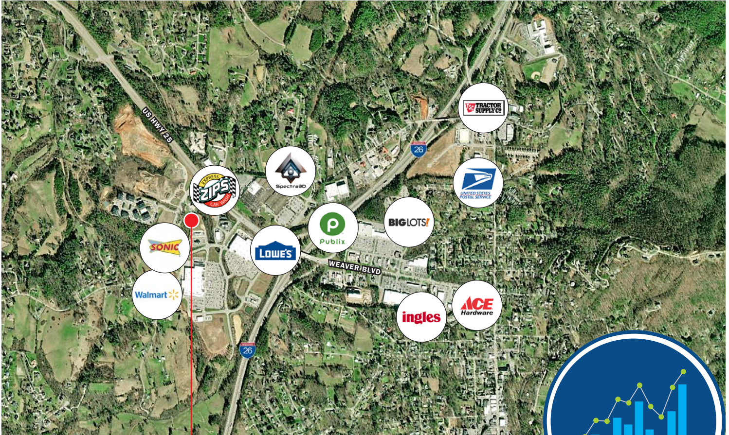
MAP CREDIT: NOAA