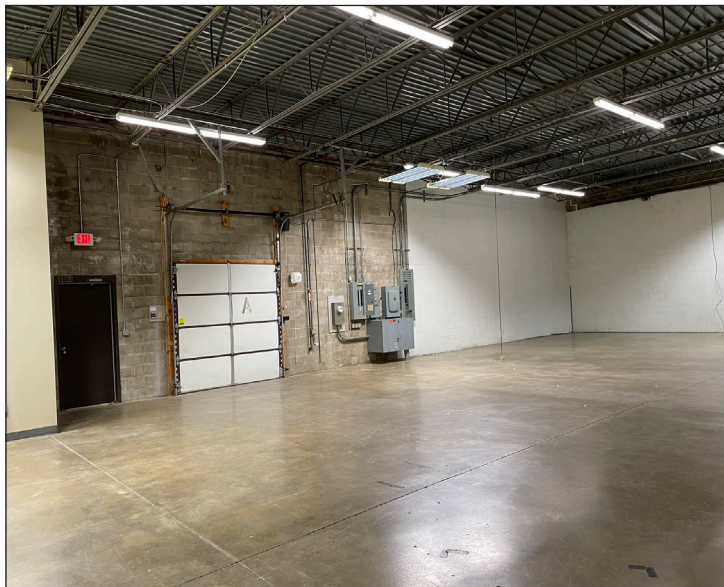
Warehouse with Dock Door