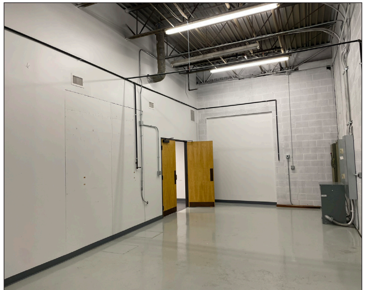
Warehouse with Dock Door