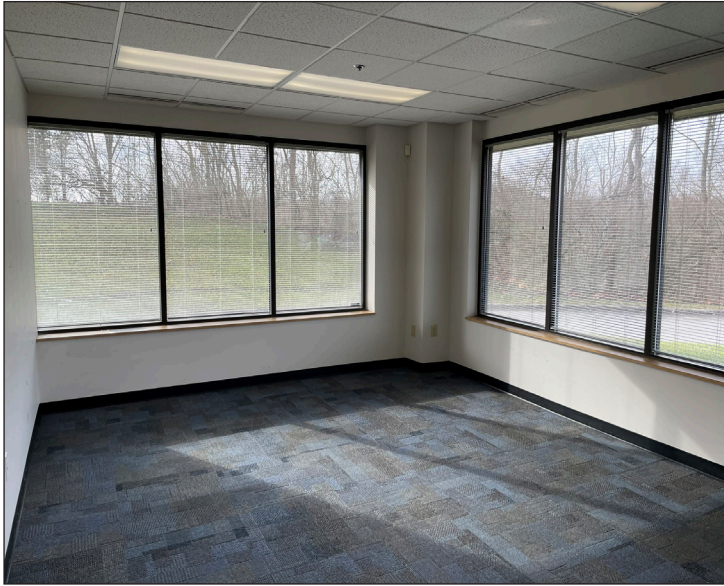
Sample - Private Office