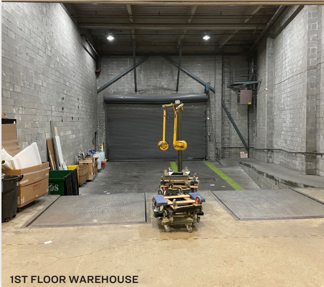
1ST FLOOR WAREHOUSE