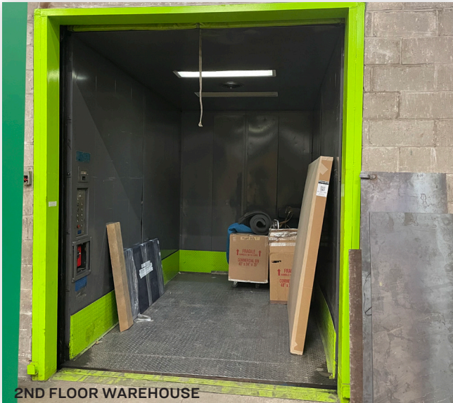
2ND FLOOR WAREHOUSE