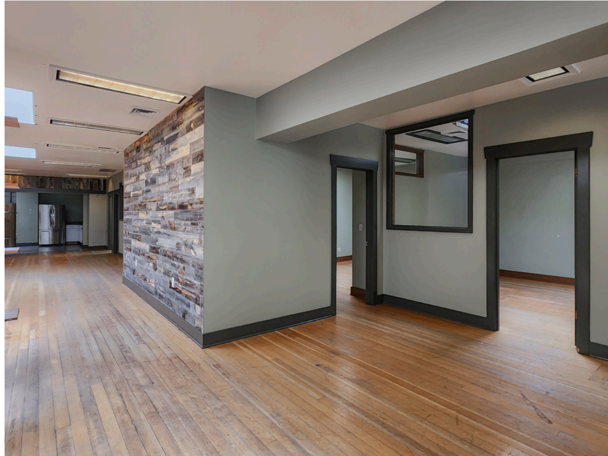
Above: Entrance to private offices from the main area