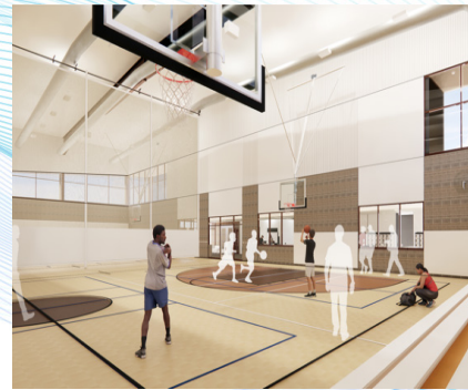
THE COMMONS AT SUMMERCREST COMMERCIAL