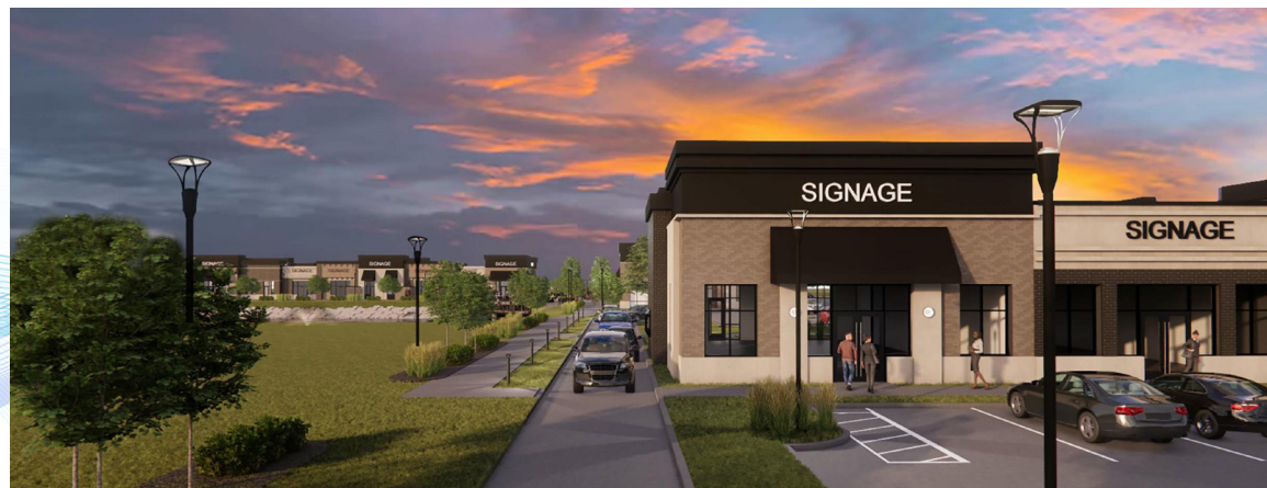
THE COMMONS AT SUMMERCREST COMMERCIAL