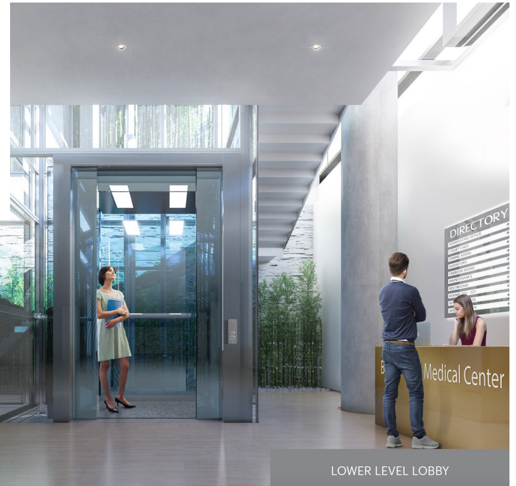
LOWER LEVEL LOBBY