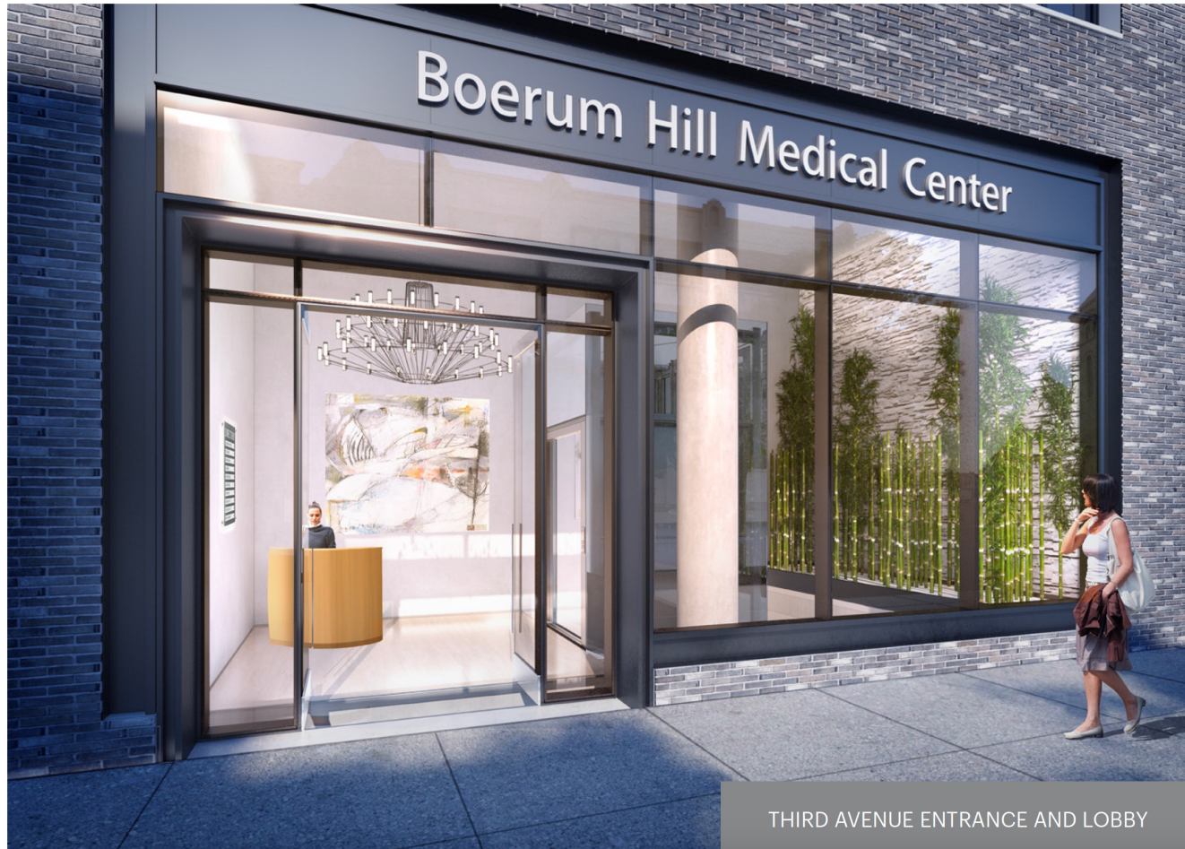
THIRD AVENUE ENTRANCE AND LOBBY