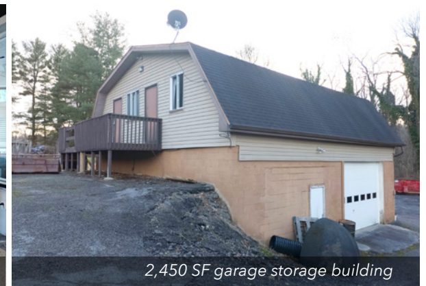
2,450 SF garage storage building