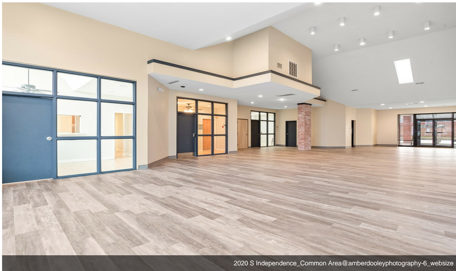
2020 S Independence_Common Area@amberdooleyphotography-6_websize