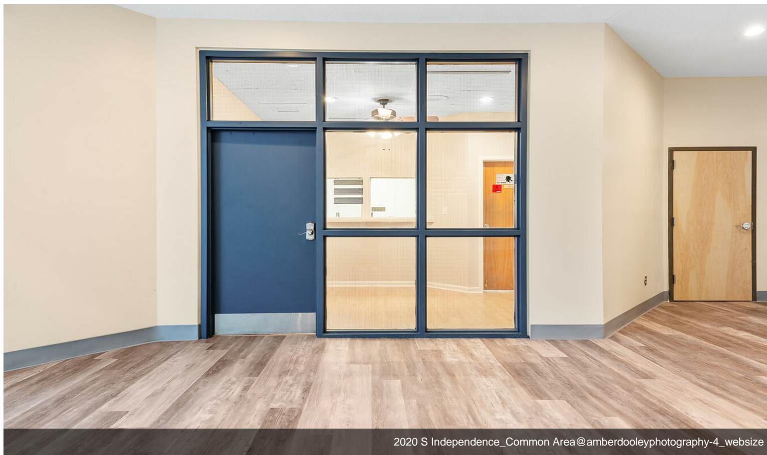
2020 S Independence_Common Area@amberdooleyphotography-4_website