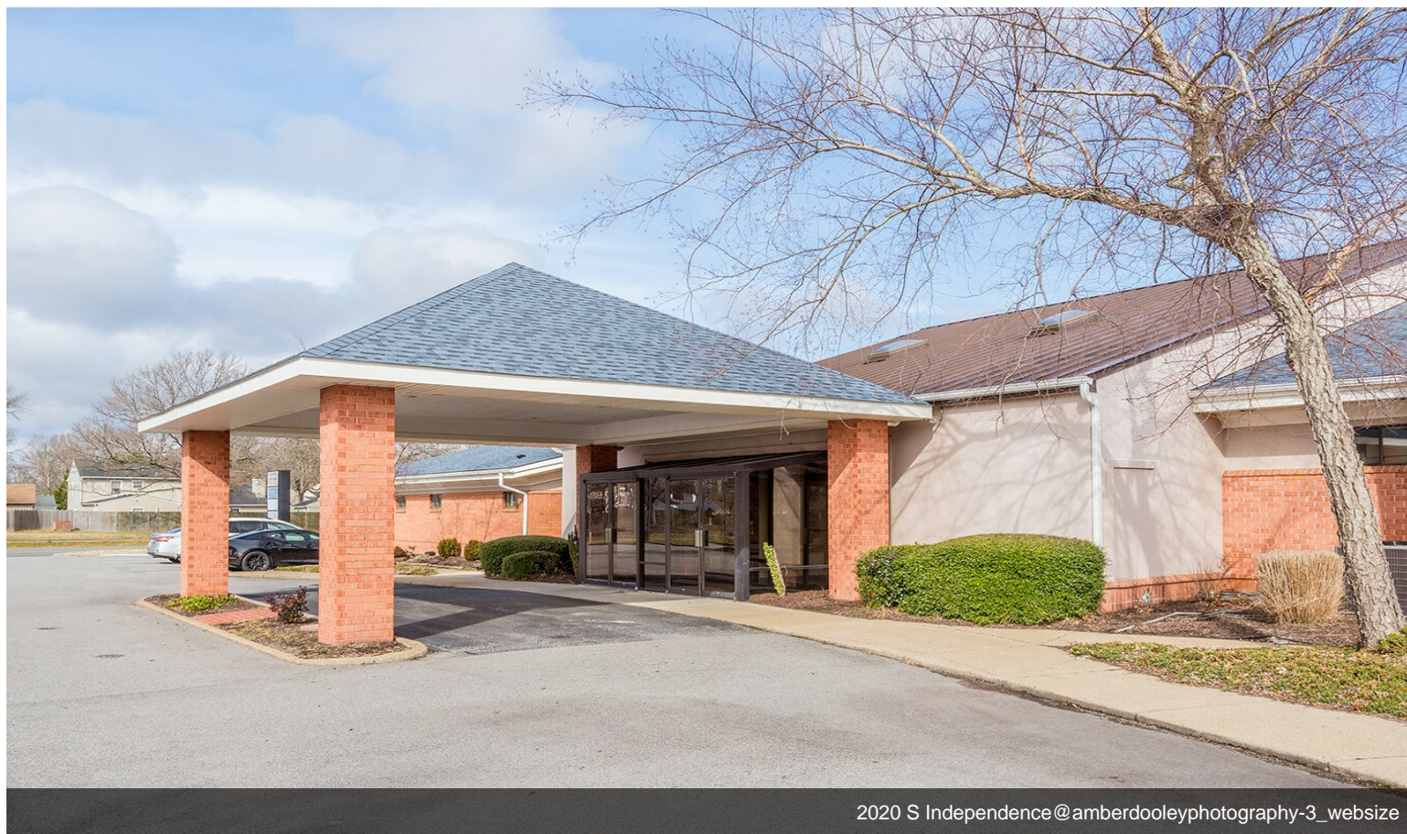
2020 S Independence@amberdooleyphotography-3_websize