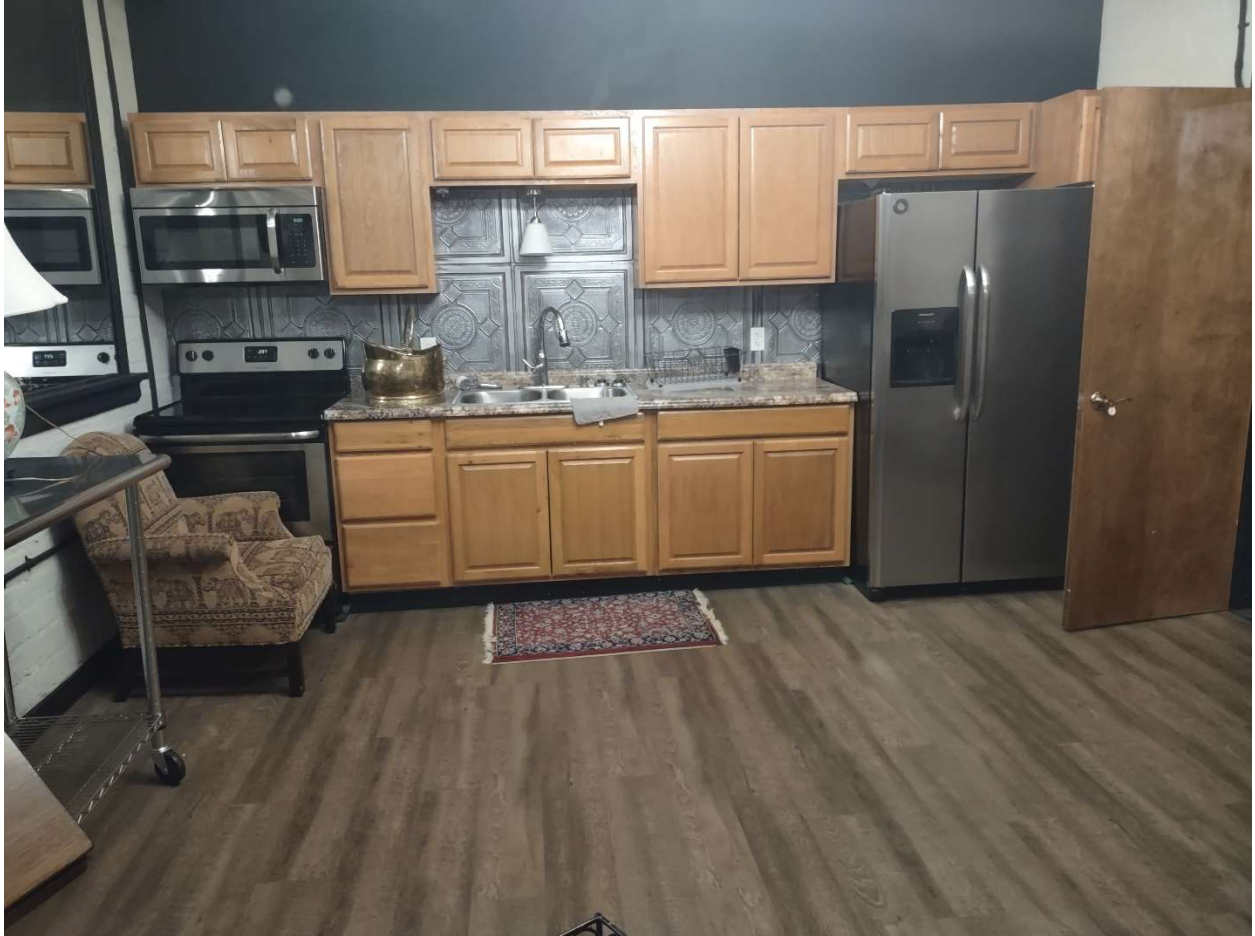
Future Suite C: First Floor Office/Retail