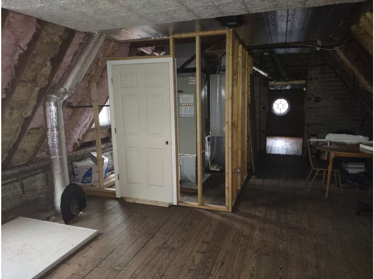
Future Suite D: Second Floor Office