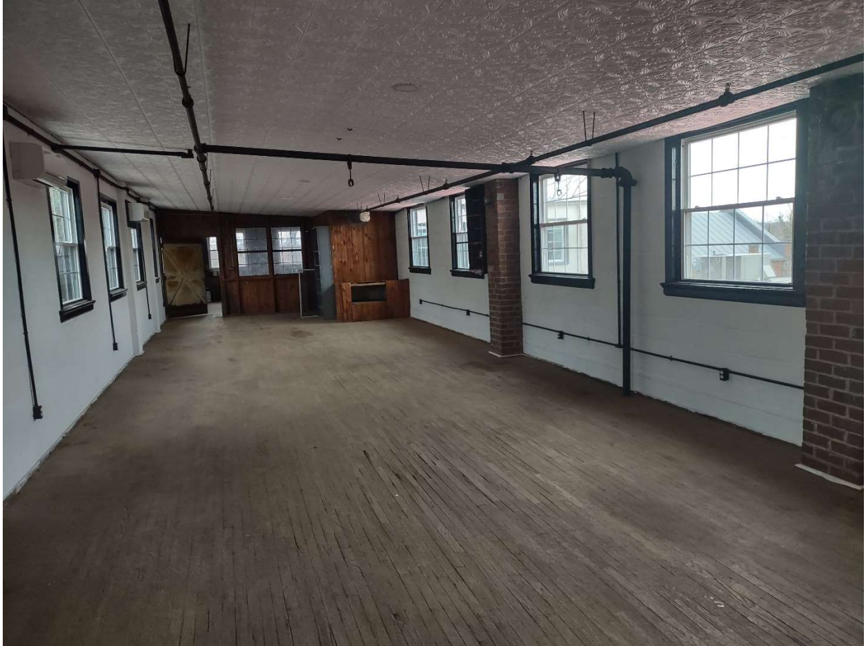
Rear Warehouse – Second Level - Future Suite B: Office/Retail Space