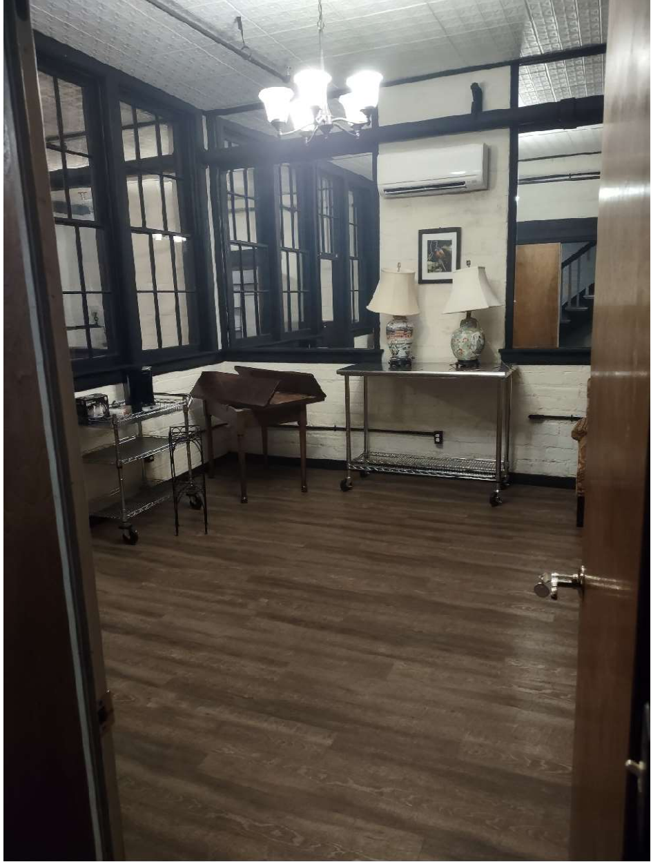
Future Suite C: First Floor Office/Retail