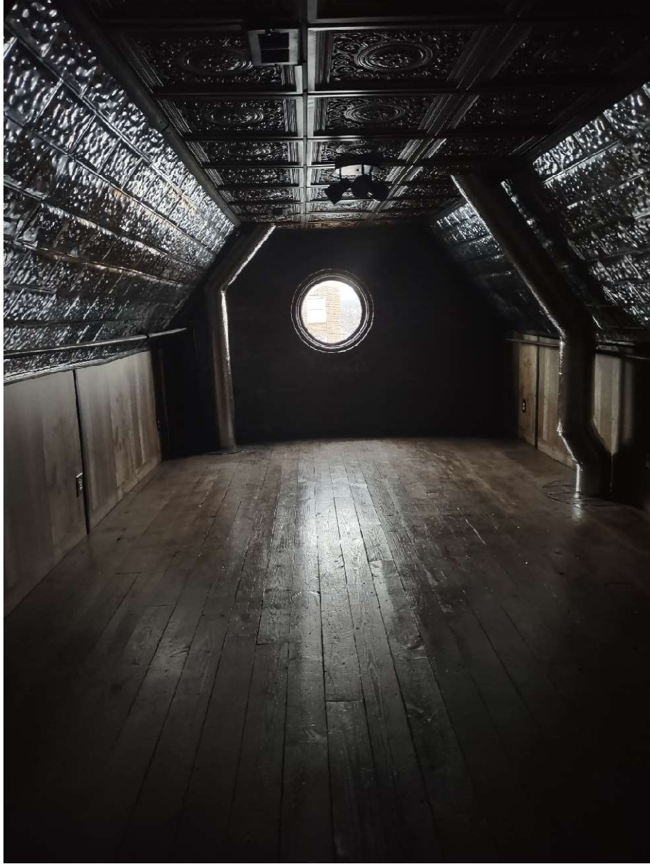
Future Suite D: Second Floor Office