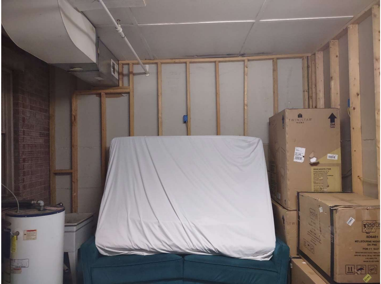
Existing Storage/Utility Room – Future Wall Demo