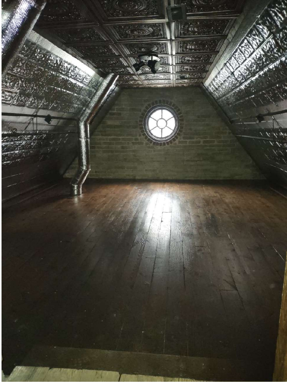
Future Suite D: Second Floor Office