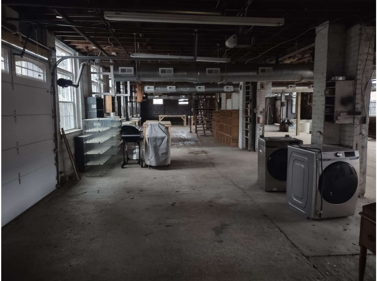
Rear Warehouse – First Level - Future Events Venue