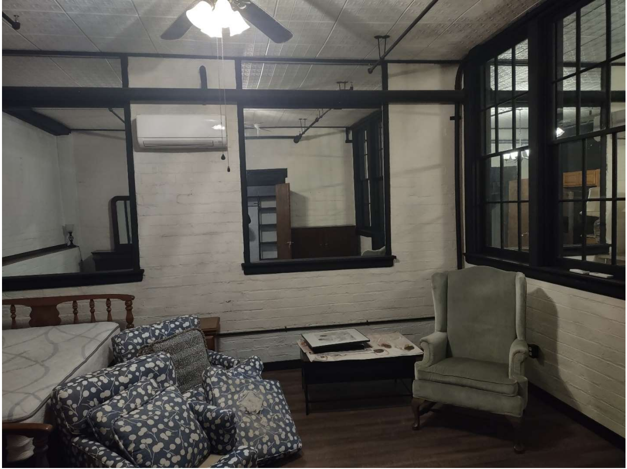
Future Suite C: First Floor Office/Retail