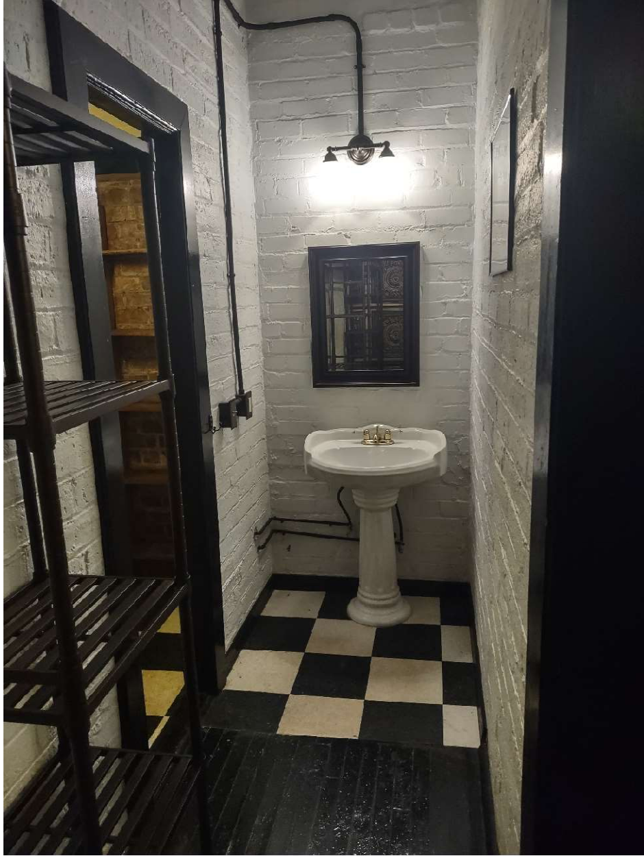
Future Suite C: First Floor Office/Retail Private Bathroom