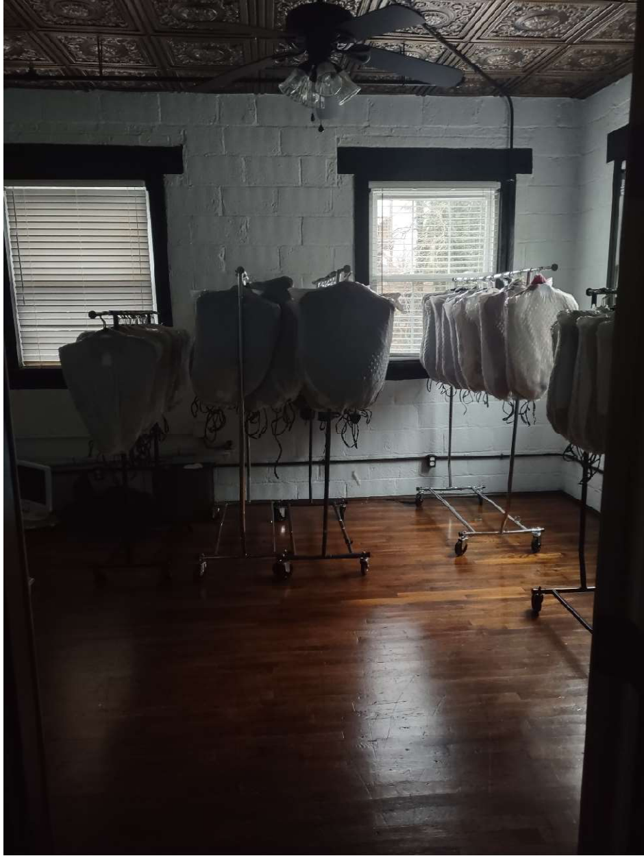
Future Suite D: Second Floor Office