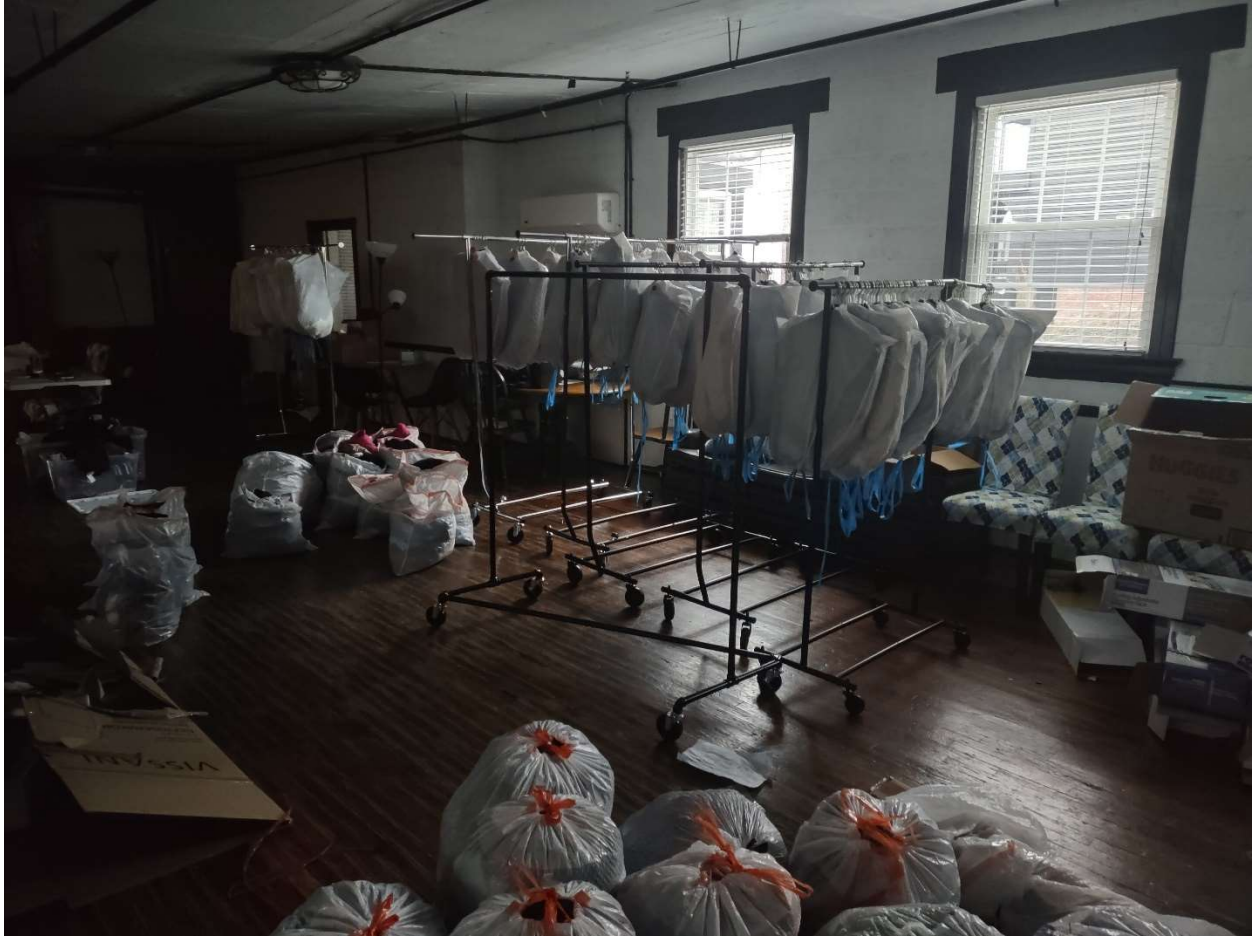
Future Suite D: Second Floor Office