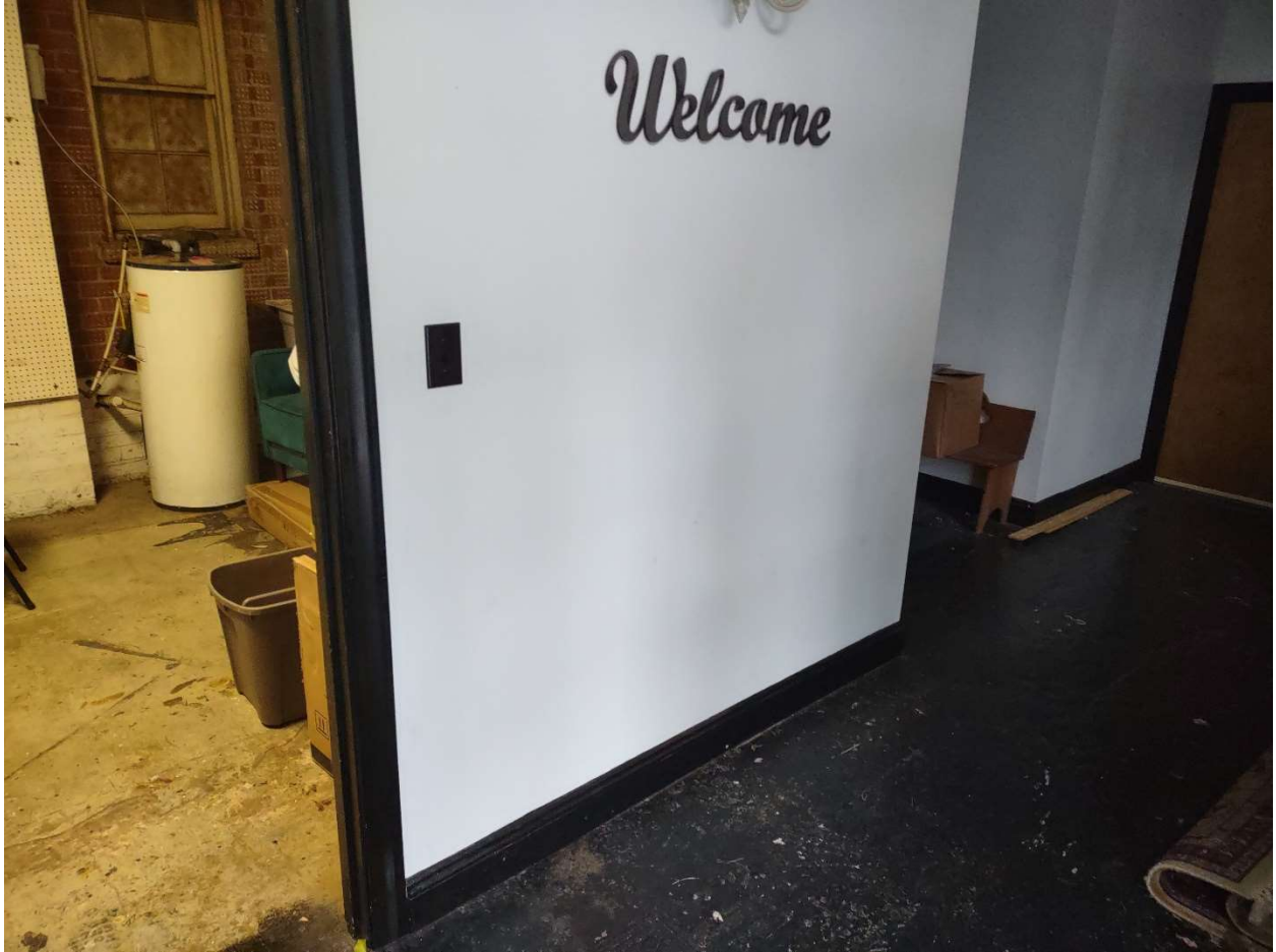
Common Foyer – Future Wall Demo