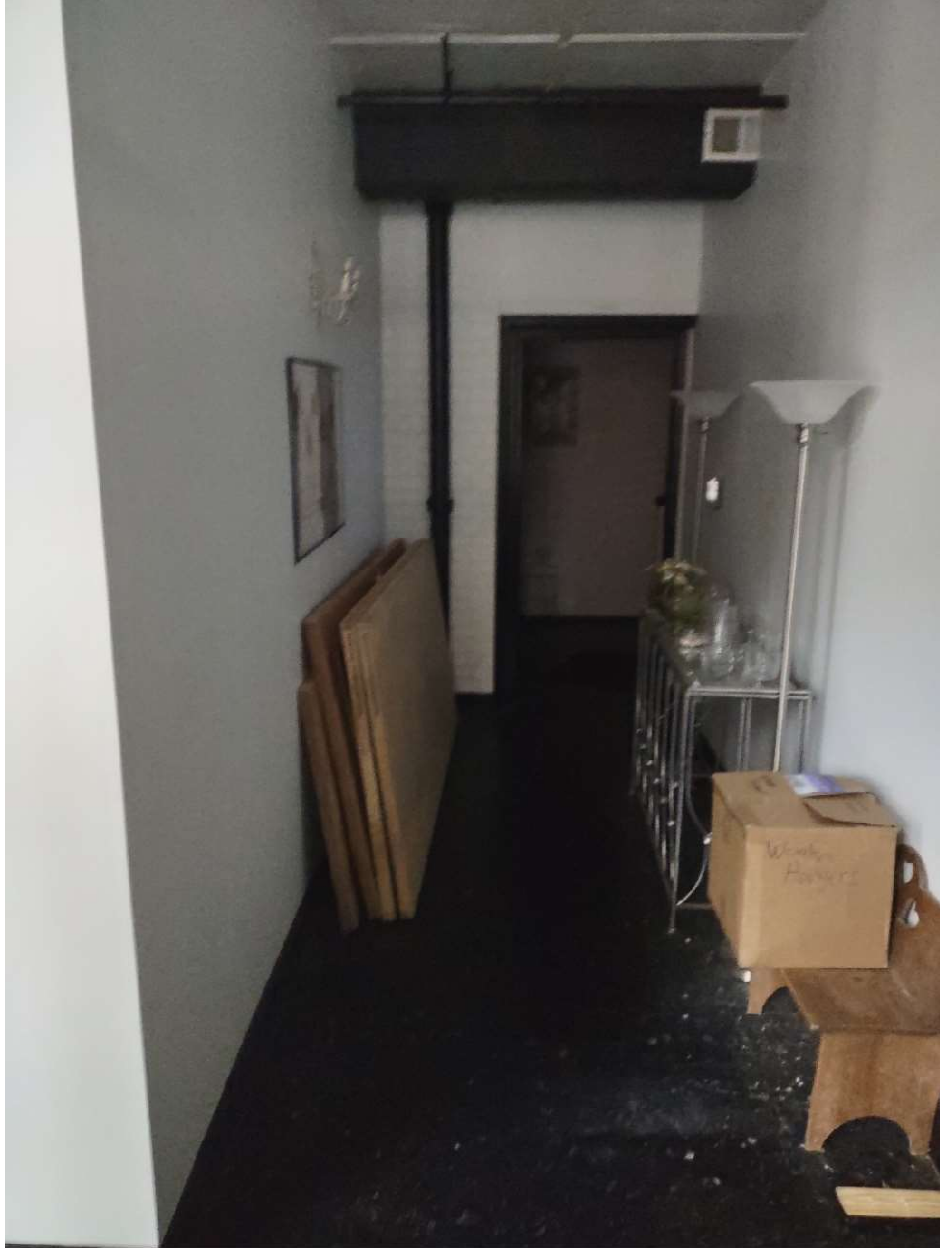
Common Foyer – Future Wall Demo (on Left)