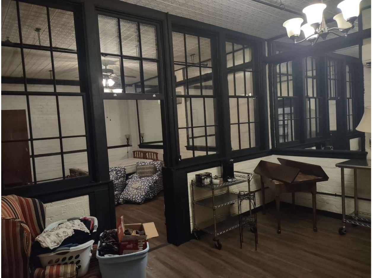
Future Suite C: First Floor Office/Retail