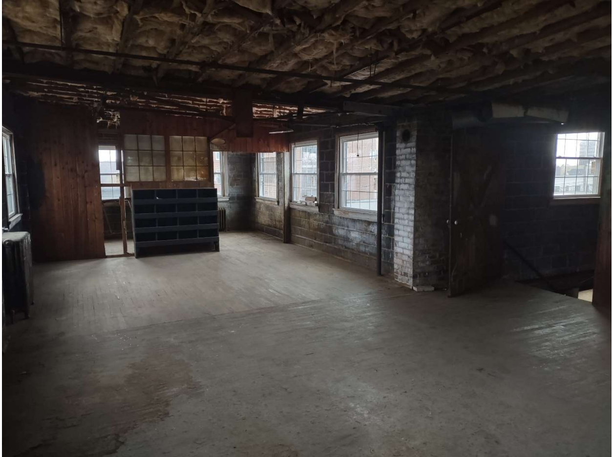
Rear Warehouse – Second Level – Future Suite B: Office/Retail Space