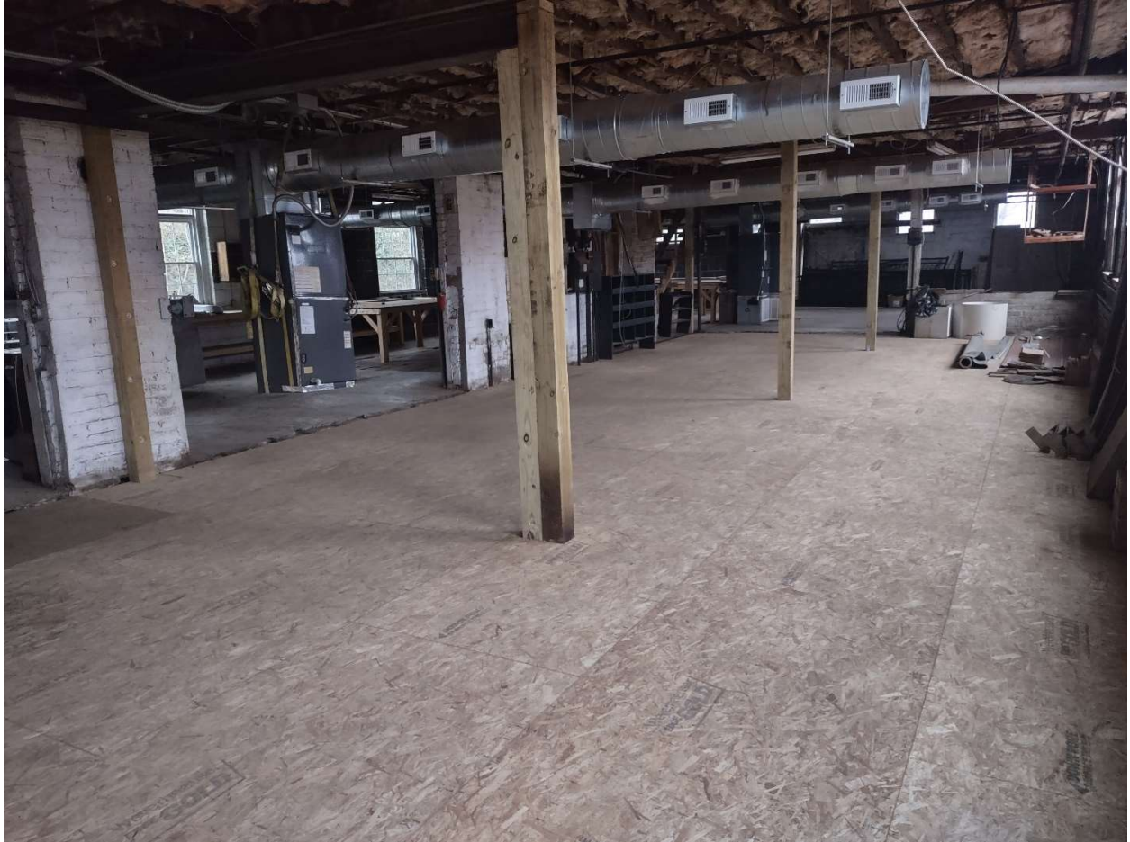
Rear Warehouse – First Level - Future Events Venue