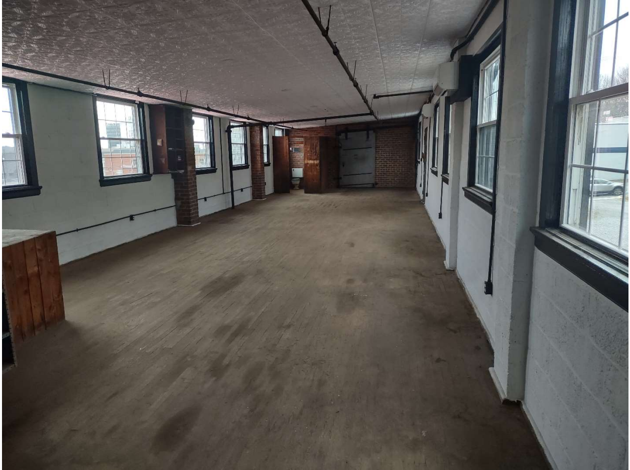
Rear Warehouse – Second Level – Future Suite B: Office/Retail Space