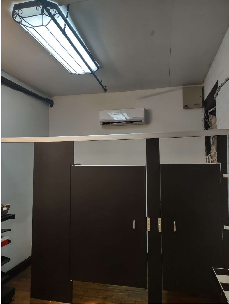
Existing Women's Common Restroom – Future Individual Restrooms