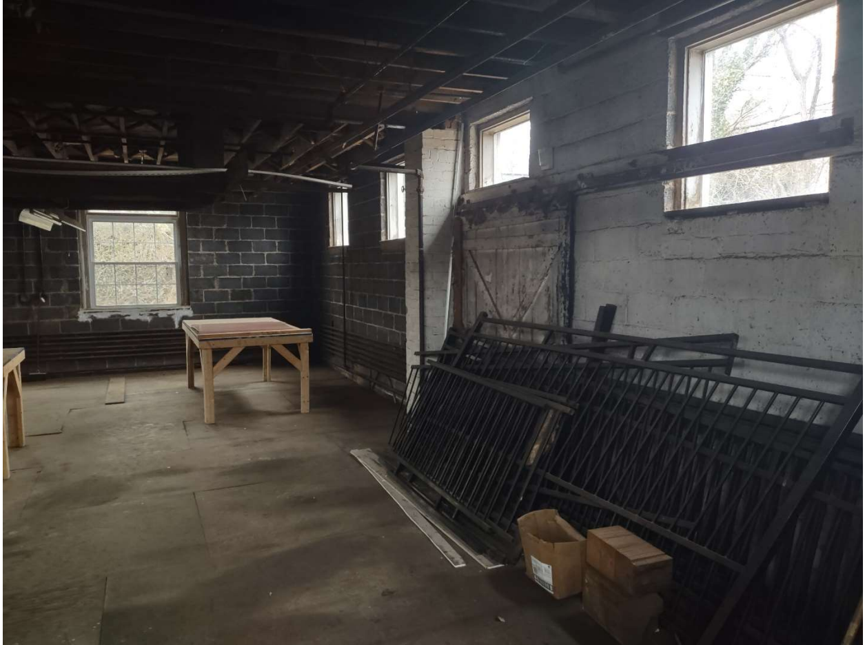
Rear Warehouse – First Level - Future Events Venue