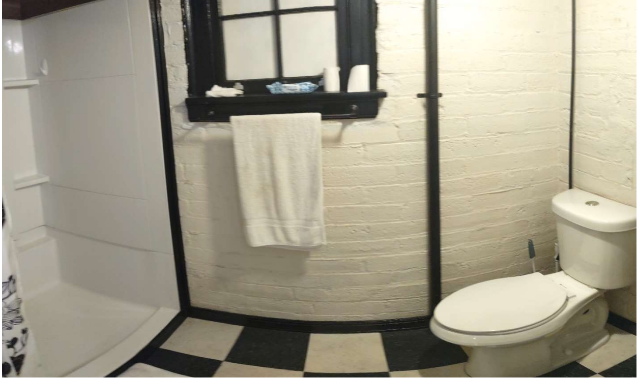
Future Suite C: First Floor Office/Retail Private Bathroom