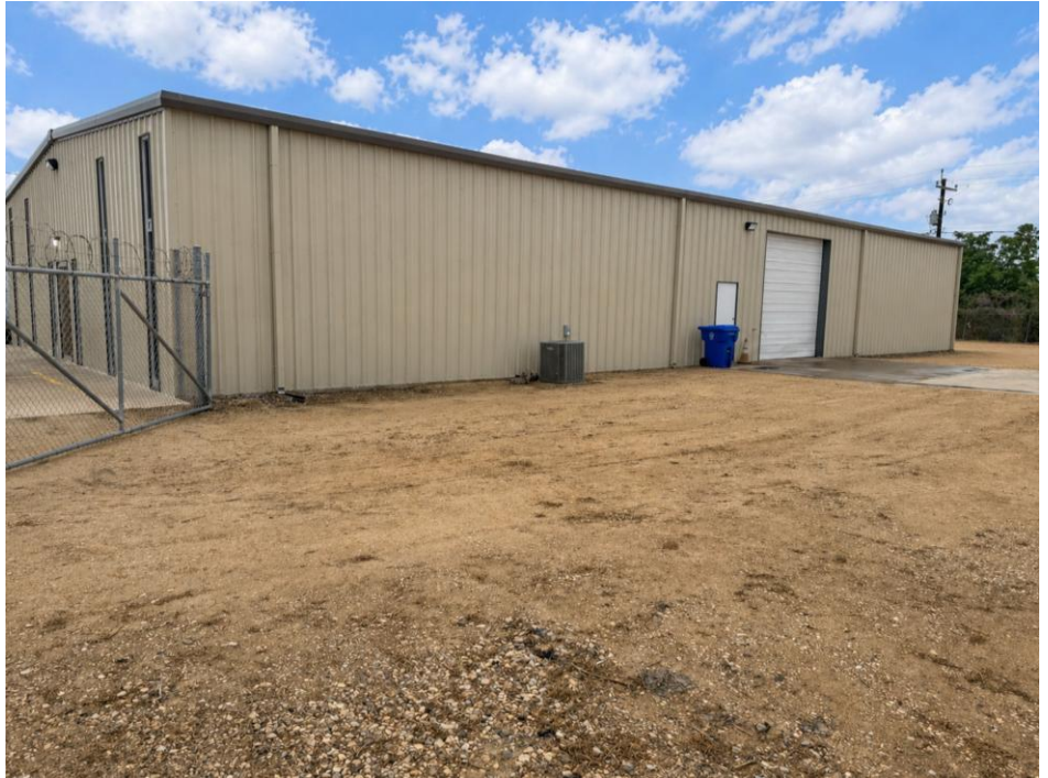
Building 1 Exterior