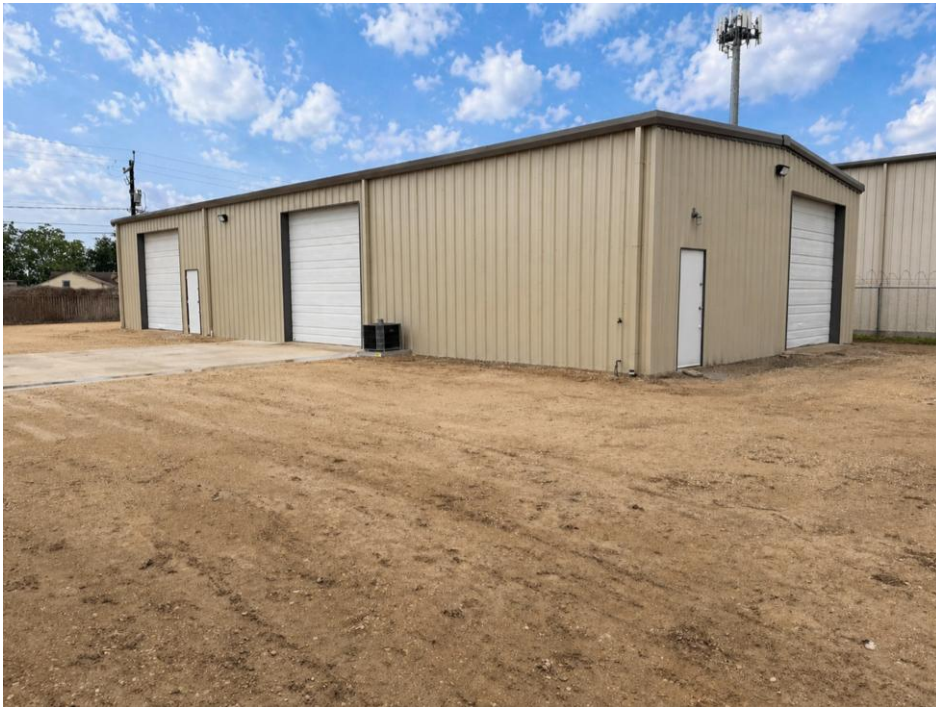
Building 2 Exterior