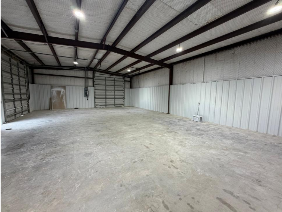
Building 1 Warehouse