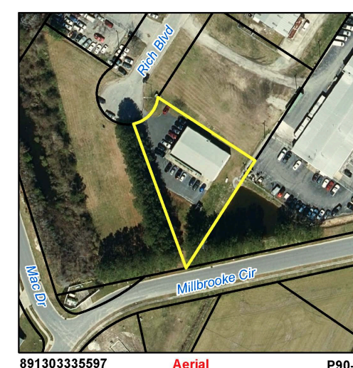
891303335597 Aerial P90-55