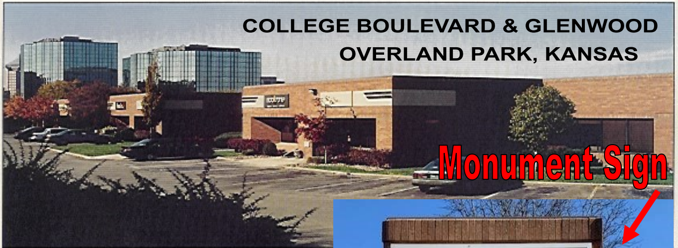
COLLEGE BOULEVARD & GLENWOOD OVERLAND PARK, KANSAS

110th & College Boulevard Overland Park, Kansas