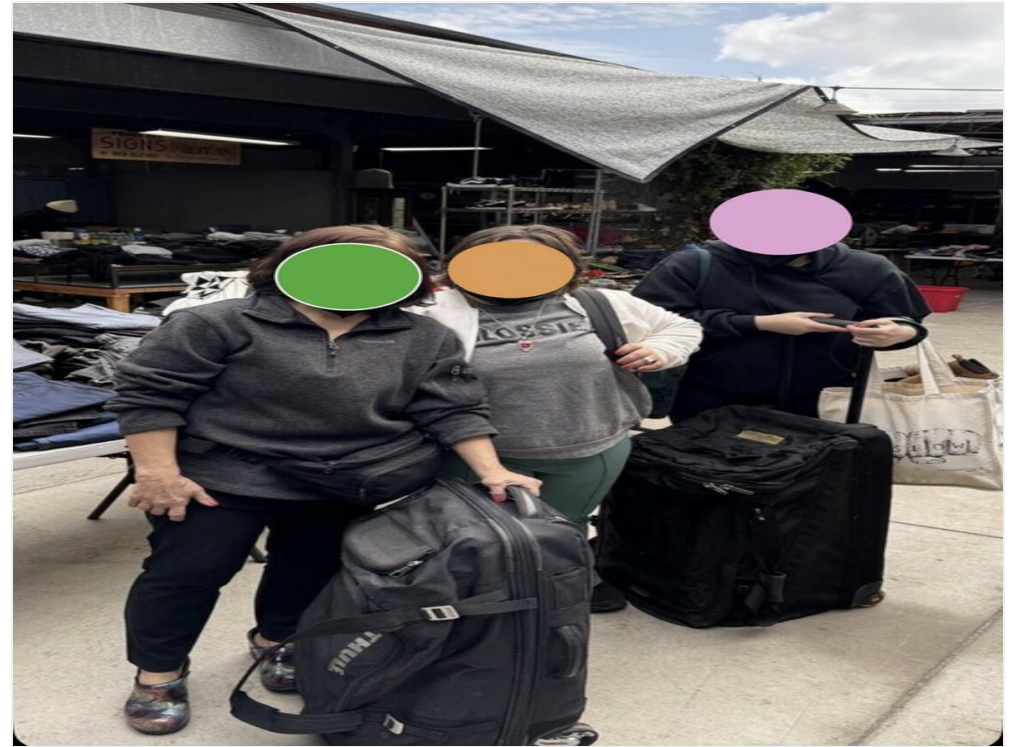
Exterior view for estate sale