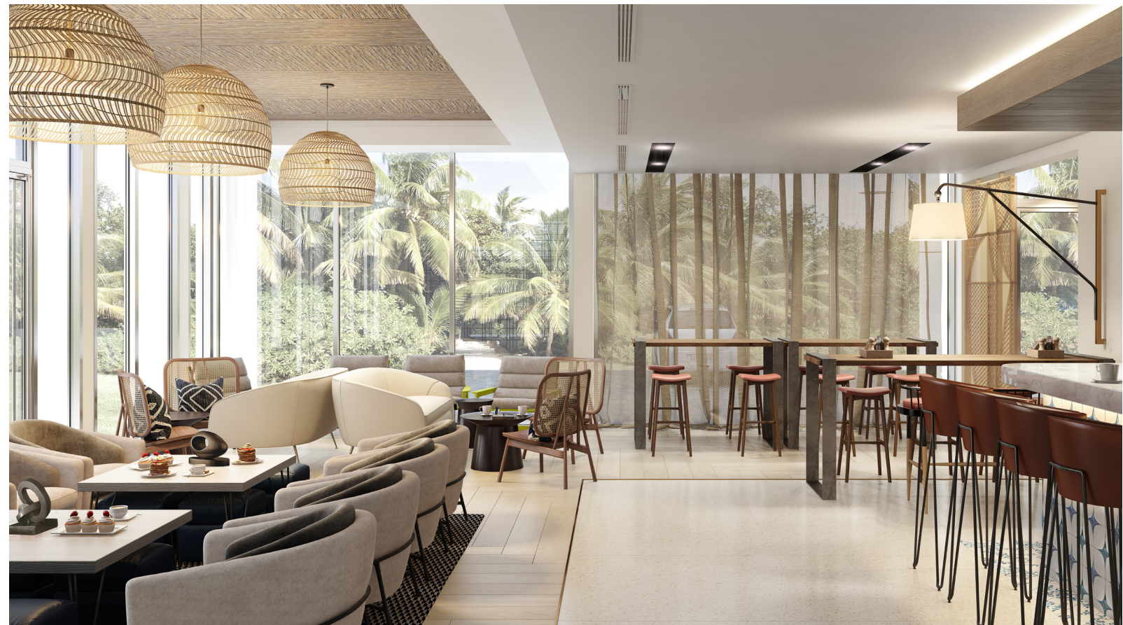
HOTEL PROPOSED RENDERINGS