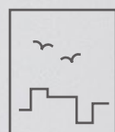
LARGE WINDOW VIEWS