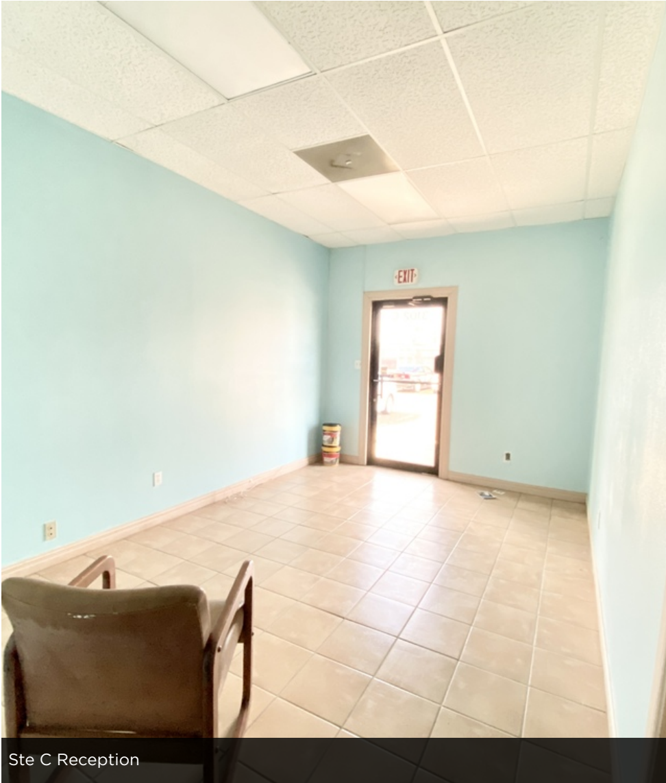
Ste C Reception