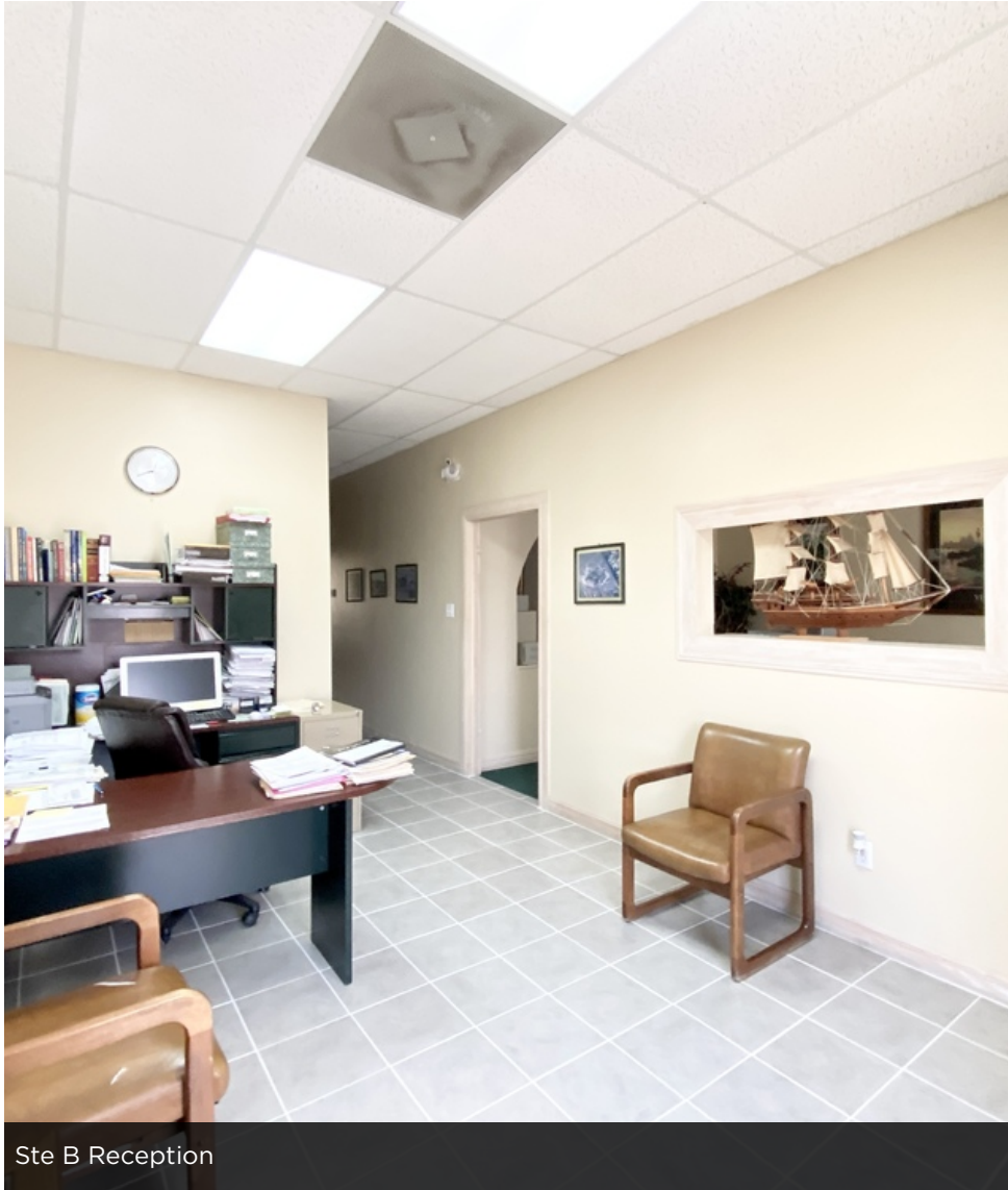
Ste B Reception