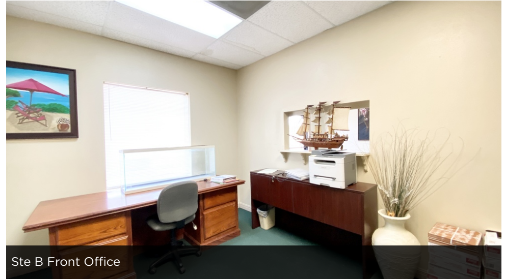
Ste B Front Office