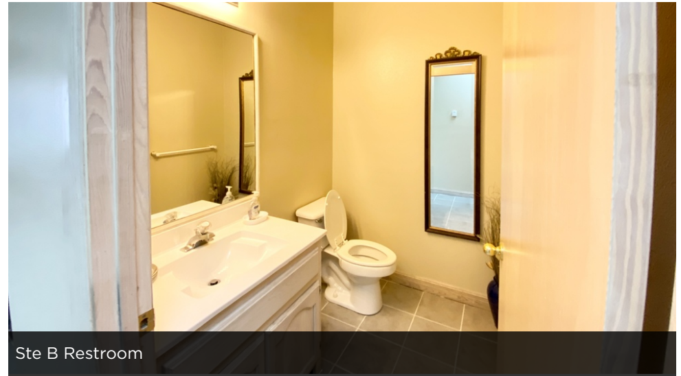
Ste B Restroom