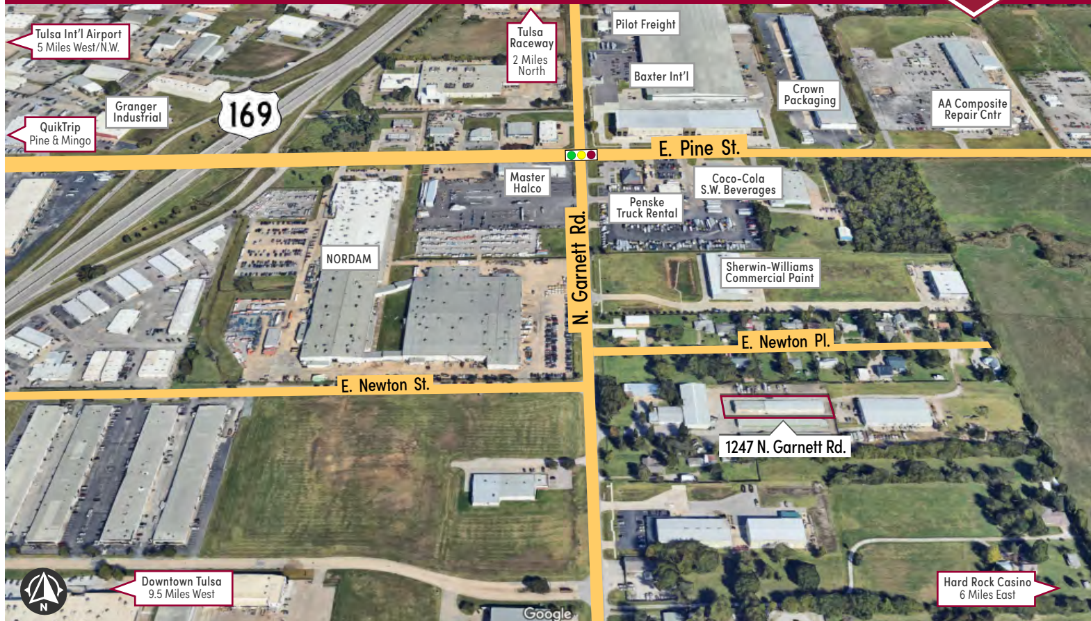
Greater Tulsa Area Map