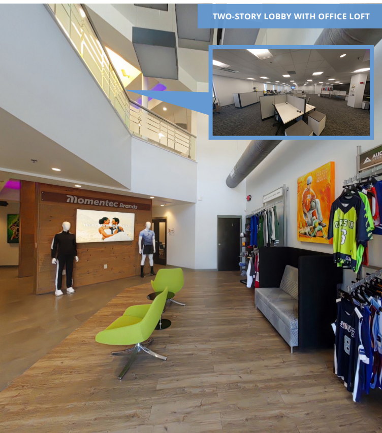
TWO-STORY LOBBY WITH OFFICE LOFT