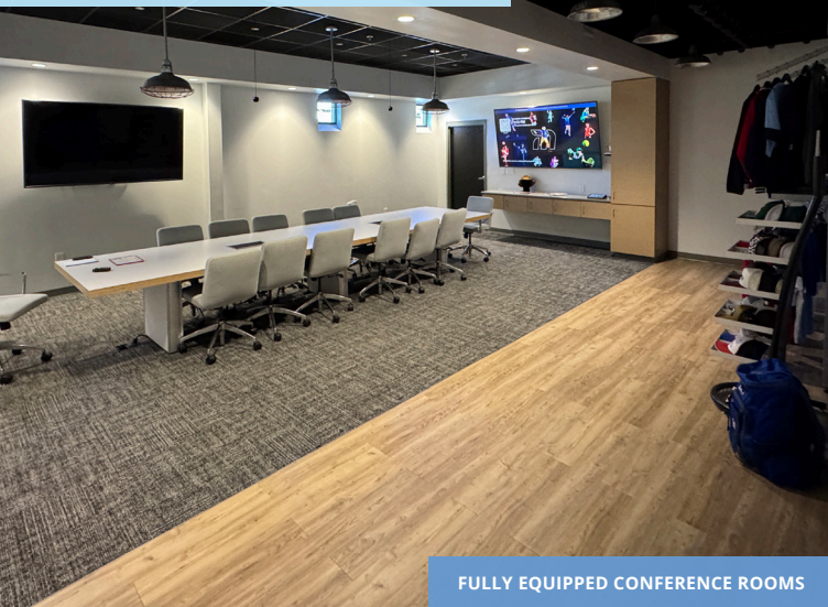
FULLY EQUIPPED CONFERENCE ROOMS