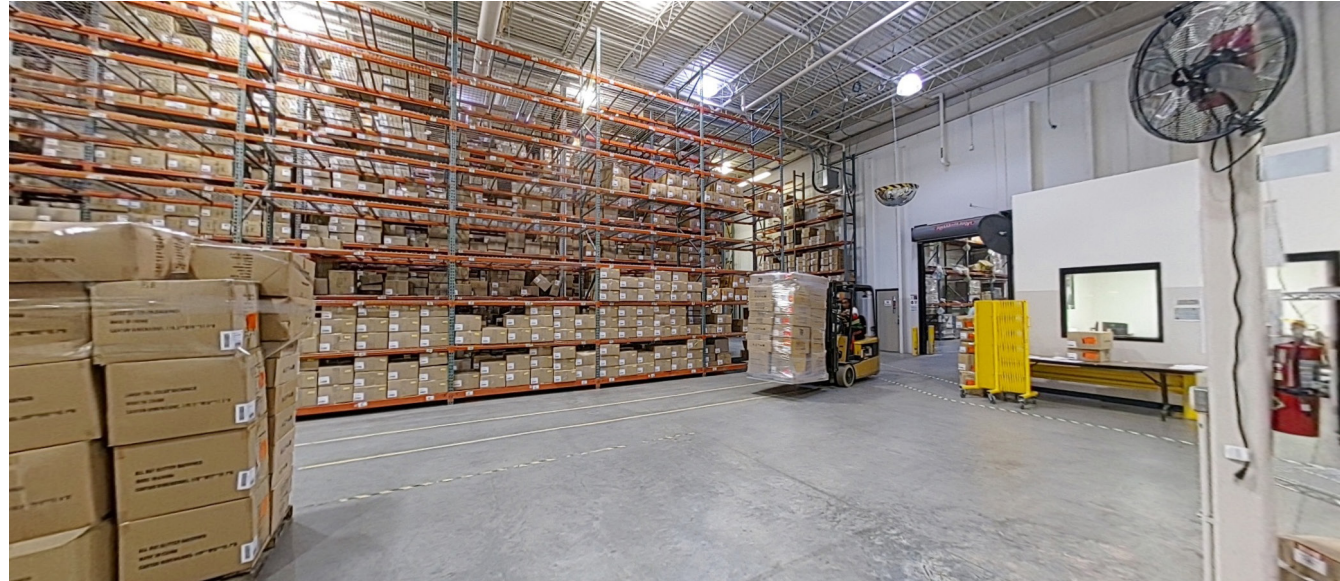
WELL-MAINTAINED LOADING DOORS