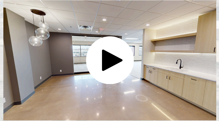
Suite 330 - 1,990 SF