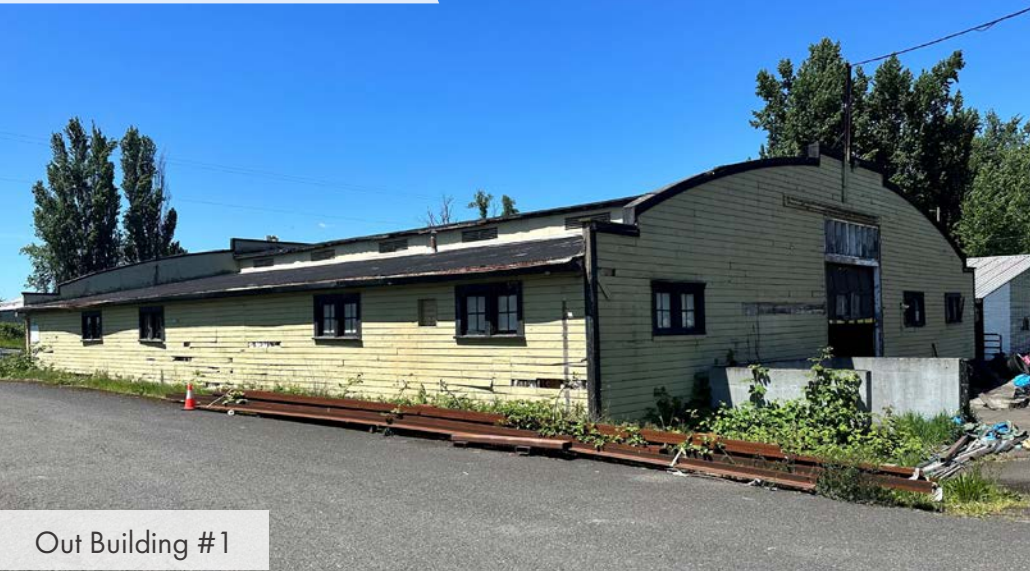
Out Building #1