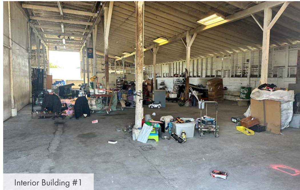
Interior Building #1

For more information or a property tour, please contact: