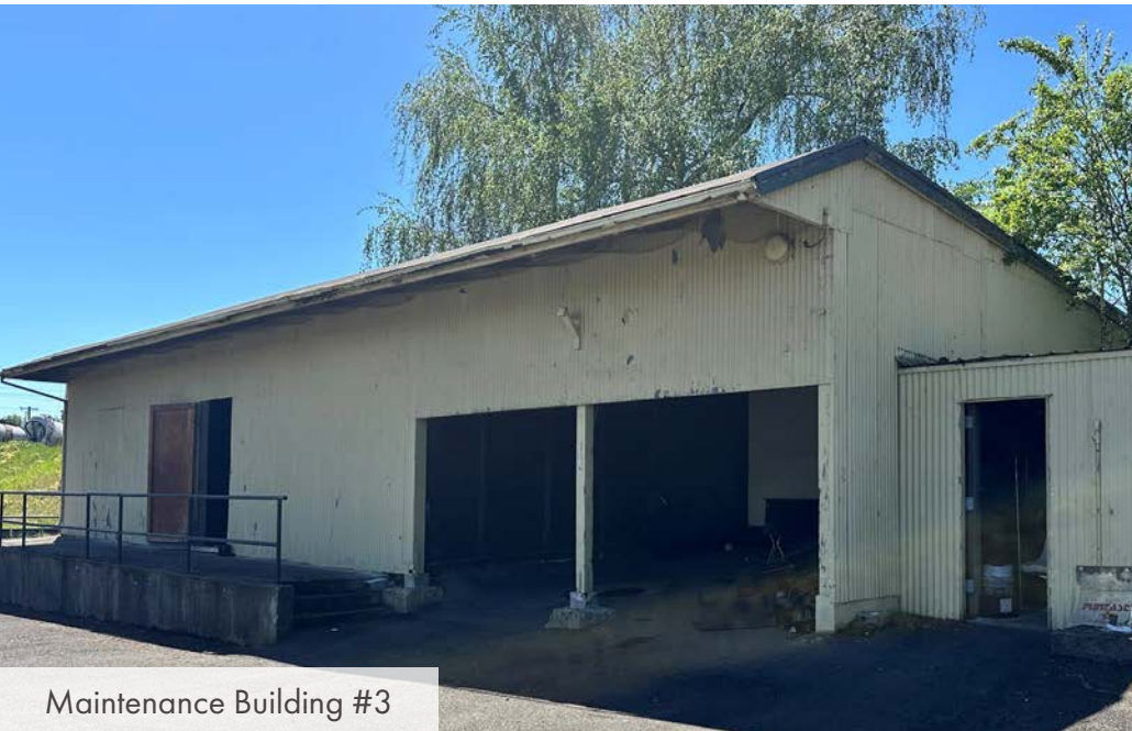
Maintenance Building #3