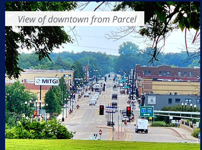
View of downtown from Parcel