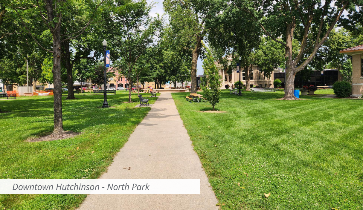
Downtown Hutchinson - North Park