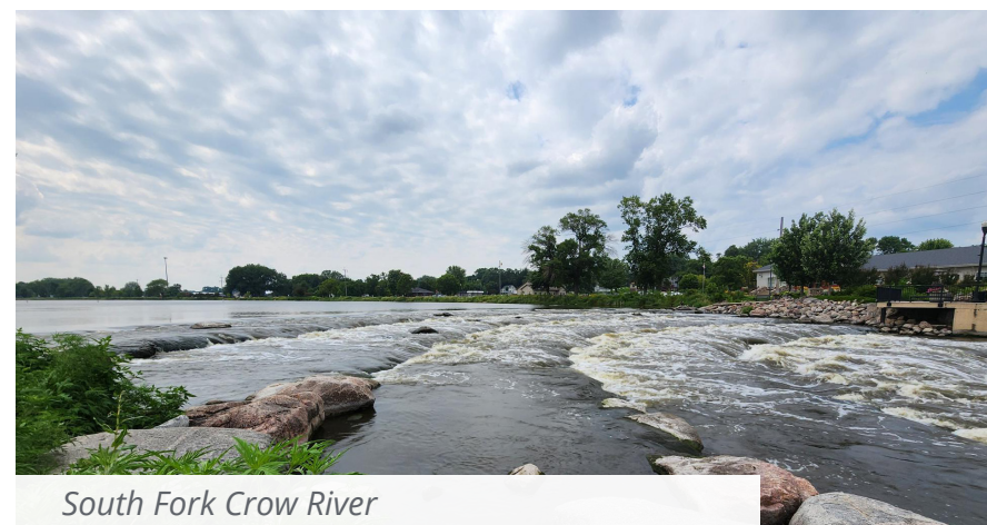
South Fork Crow River