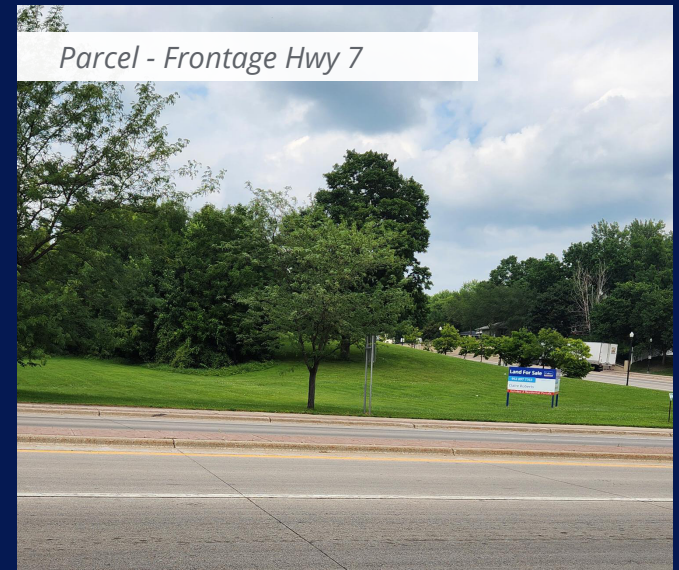
Parcel - Frontage Hwy 7