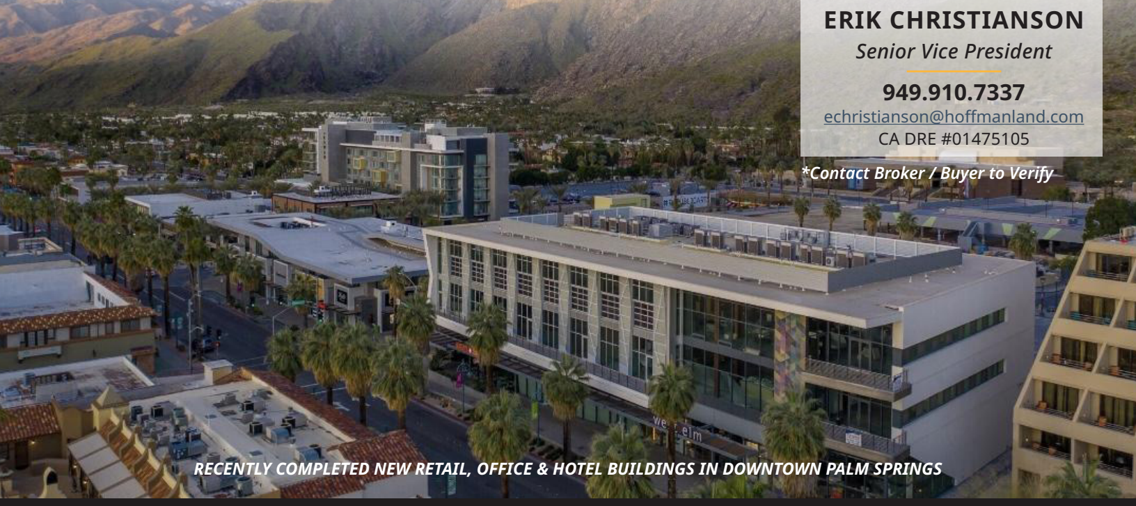
RECENTLY COMPLETED NEW RETAIL, OFFICE & HOTEL BUILDINGS IN DOWNTOWN PALM SPRINGS