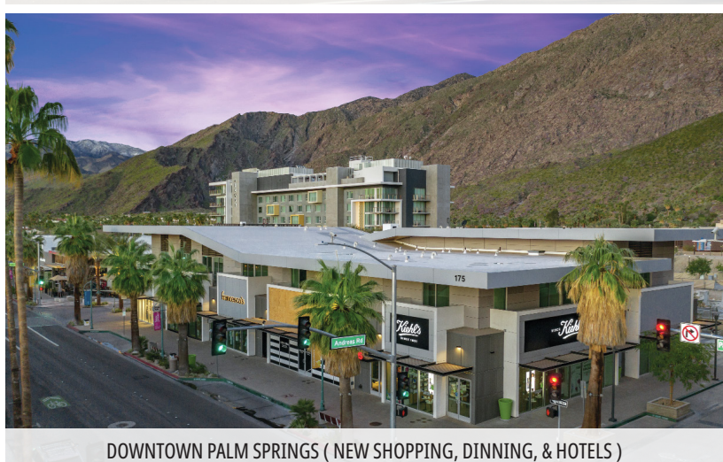
DOWNTOWN PALM SPRINGS ( NEW SHOPPING, DINNING, & HOTELS )