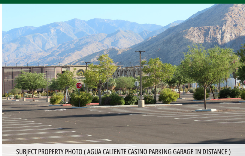
SUBJECT PROPERTY PHOTO ( AGUA CALIENTE CASINO PARKING GARAGE IN DISTANCE )